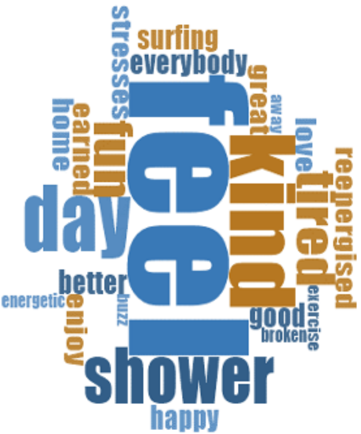
Figure 3: Word cloud representing the frequency of words related to Surfswell experience in the interviews. The size of each word indicates its frequency across the interviews.

The words most frequently associated with Surfswell during this phase of the research were “feel” and “kind”. Other frequently used words included “reenergised”, “fun”, “enjoy”, “better”, “love”, “happy” and “good”. The most commonly occurring words are shown in the word-cloud below (Figure 3).