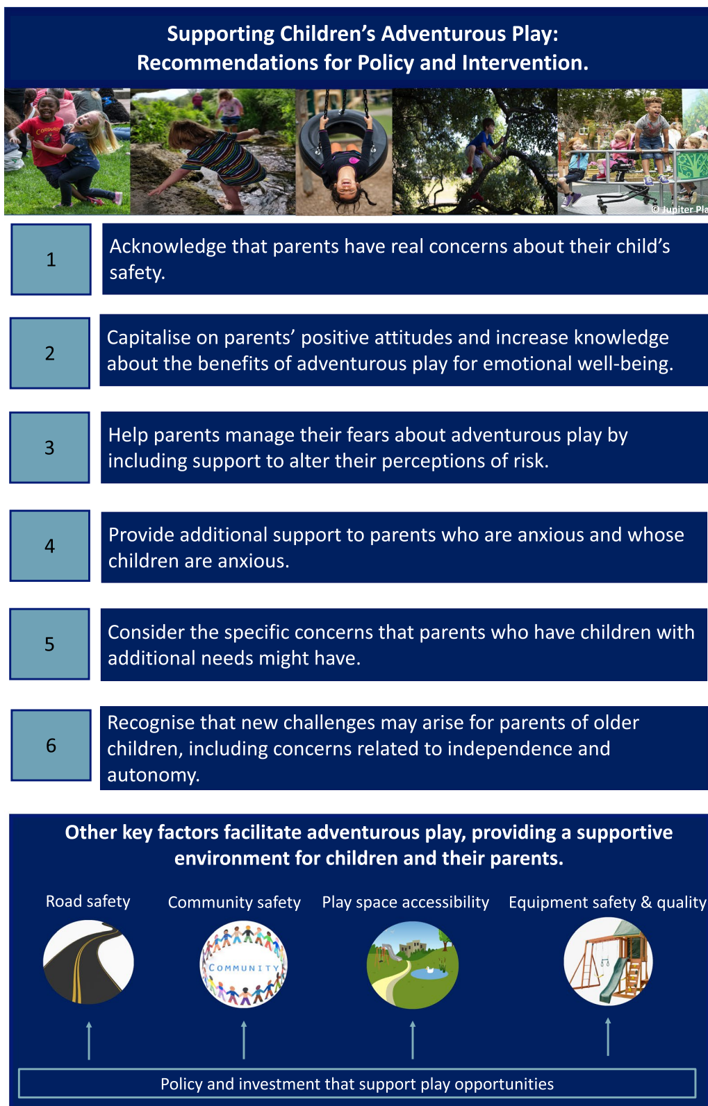
Fig. 2 Recommendations for policy and interventions