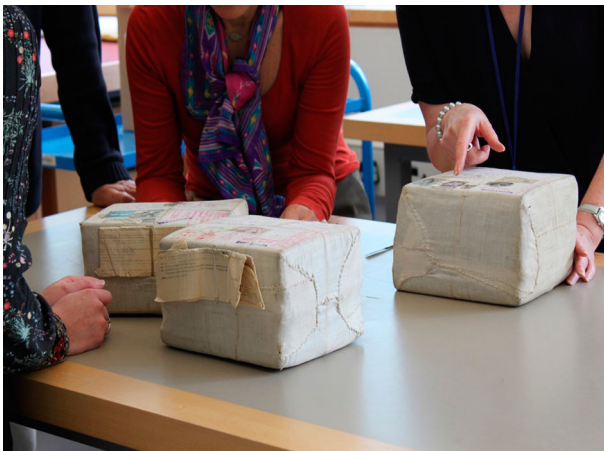
Figure 2. Packages from Praver Jhabvala's literary archive being examined in the Conservation studio at the British Library. Image © British Library Board.