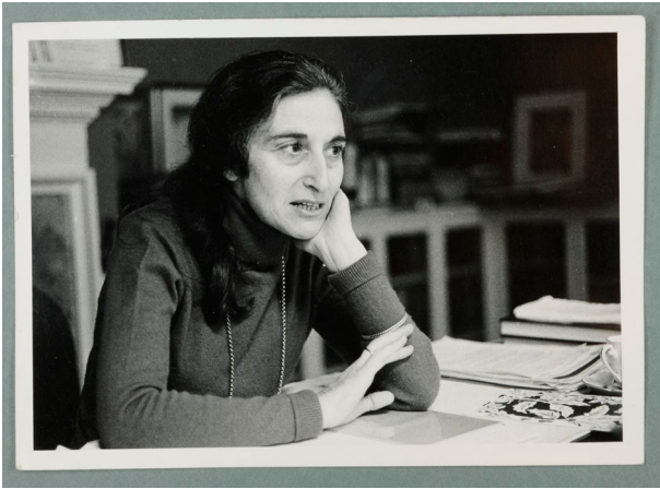
Figure 1. Ruth Praver Jhabvala.