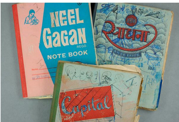
Figure 3. Praver Jhabvala's notebooks.