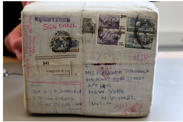
Figure 4. Package with exterior markings and stamps.