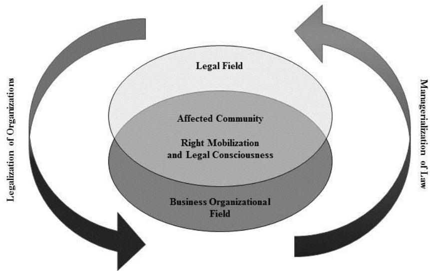
Figure 1: Theoretical framework (adapted from Edelman, 2016)