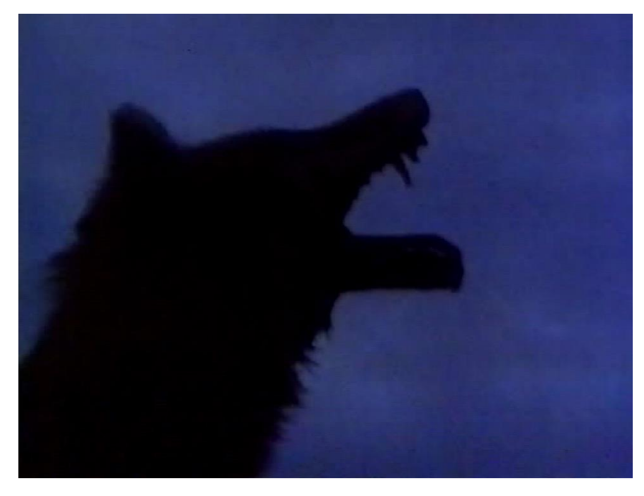
Fig. 3. Barking at the Moon. Despite evoking wolves in Transylvania, this striking image was created using a fox puppet in woods near Fairmilehead.

general public. In the Doomwatch episode 'The Inquest' (March 1971), for example, no one knows the source of the infection when a schoolgirl dies of rabies in a small Yorkshire town. Some aspects of The Mad Death are anticipated in 'The Inquest', such as the deep-set public resistance to killing pets – there is uproar when scientist Colin Bradley of the Doomwatch team recommends the destruction of every dog within a five-mile radius of the town – and the disruptive presence of an eccentric pet-loving spinster in the person of Miss Lincoln, who – like Miss Stonecroft – not only houses stray dogs but actively seeks them out, and in doing so proves a public liability. Where Doomwatch portrays Miss Lincoln's eccentricities with gentle humour, The Mad Death employs a range of tricks and techniques from the traditions of screen horror to develop Stonecroft into an independent threat as dangerous as rabies.