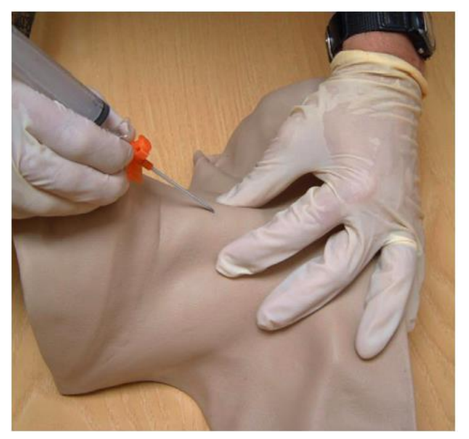
Figure 1. Part-task rescuscitation trainer for needle cricothyroidotomy (Perkins, 2007).

Research suggests that simulation of rarely performed procedures using mannequins results in an increase in confidence for a clinician to perform the procedure on a real patient when called upon. For example, Sawyer & Strandjord (2014) demonstrated significant improvements in the selfprocedural competency perceived of performing pericardiocentesis, electrocardioversion and defibrillation. A recent study by Li & Setlik (2018) also found that a simulation-based curriculum improved physician confidence in performing critical procedures such as cricothyrotomy. Other studies have also shown success in areas of airway management skills (Kovacs et al, 2000) and psychomotor skills for CPR (Niles et al, 2009). Little work has been done to explore clinical procedures skills maintenance using VR, however. This ParaVR project will replicate these studies using a VR solution, particularly for paramedics. Further we hypothesis that immersing the paramedic at the scene of an accident where they have to deal with all of the sights and sounds of the incident will further improve their confidence over and above that obtained by practicing on mannequins alone.