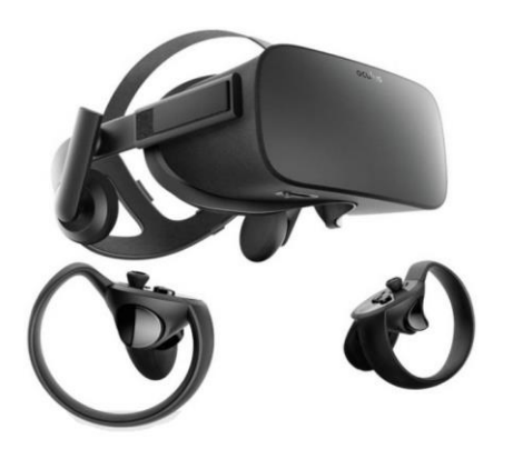
Figure 2. Wireless Hand Controllers with the Oculus Rift HMD.

In our current working prototype VR training simulator, the Oculus Rift head mounted display (HMD) is used. The oculus rift comes with wireless hand controllers (Fig. 1) which can be used by the trainee or trainer to interact with the virtual model, pick up needles and insert the needle into the virtual patient. When the needle is inserted the needle stays in place after the hand controllers let go of the needle.