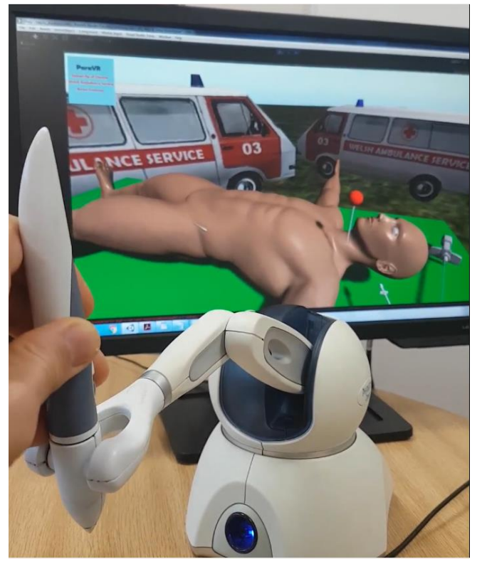
Figure 3. Geomagic Omni 6-DOF Haptic Device with the ParaVR simulator of Needle Cricothyroidotomy.

For haptic feedback, the VR simulator has also been combined with a Geomagic Touch haptic device (Fig. 3). This provides a six degree of freedom haptic interface. The stylus can be move with pitch, roll and yaw and the virtual needle follows. This provides an intuitive interface for needle insertion. When the training simulator begins, the user can then see a virtual model of the needle which moves in relation to the physical haptic stylus. The Omni stylus and the Oculus hand controllers can be used simultaneously (Figs. 3, 4) The Omni stylus is displayed on screen as a moving needle and the Rift controller is displayed as a 3D hand which can pick up needle objects from the scene.