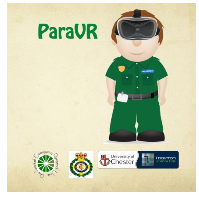
Figure 6. Splash screen displayed to the user within VR simulator.

When the VR simulator first begins, a ParaVR splash screen is displayed to the user within the VR headset (Fig. 6).