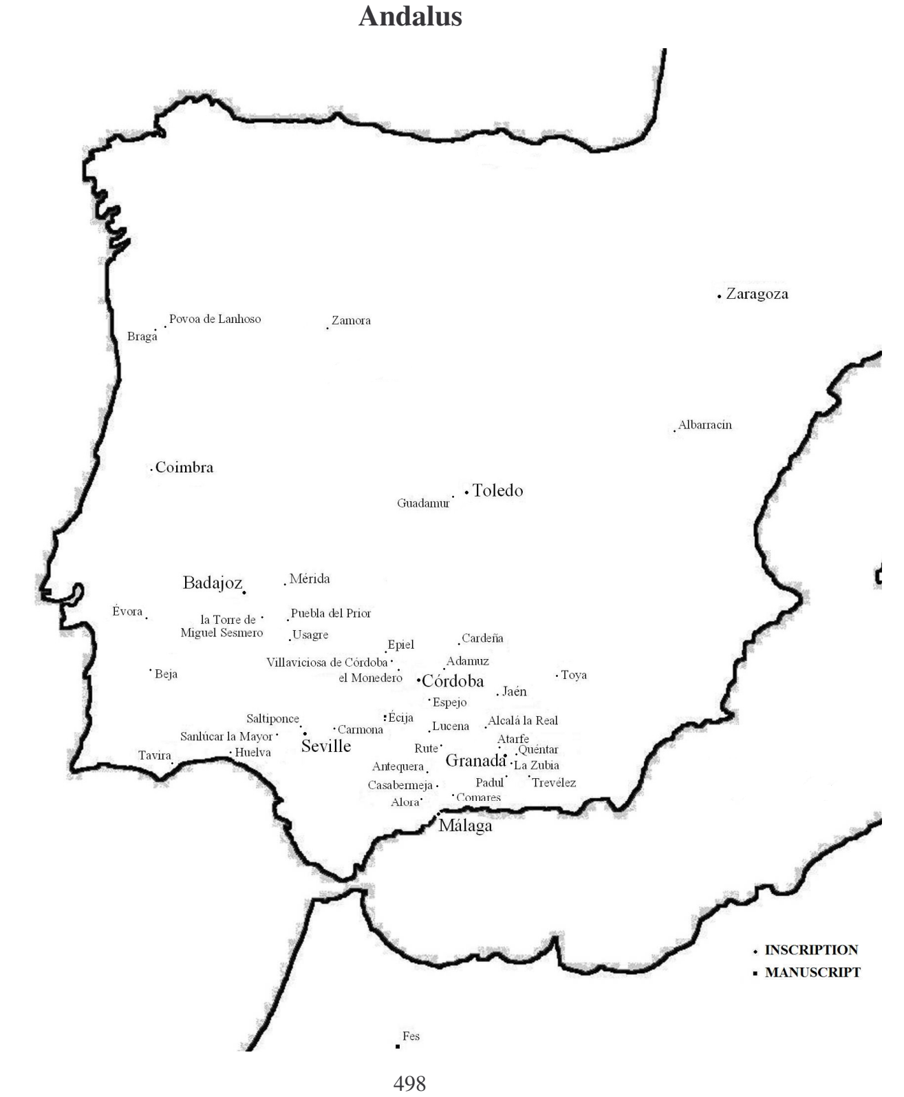
Map: Christian inscriptions and manuscript production in al-