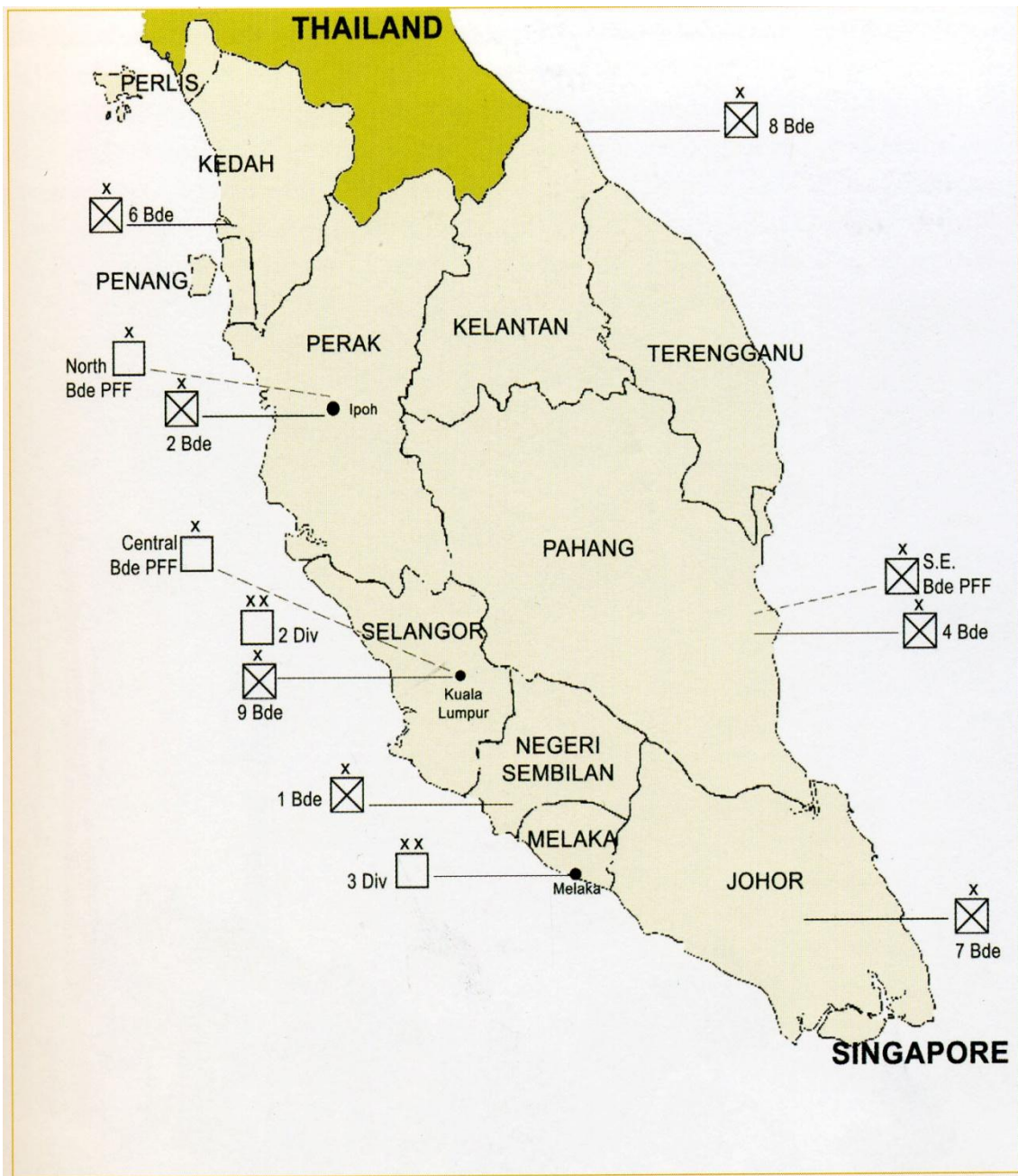
Map Showing Major Units of the Malaysian Army and Police Field Force in Peninsular Malaysia – 1977