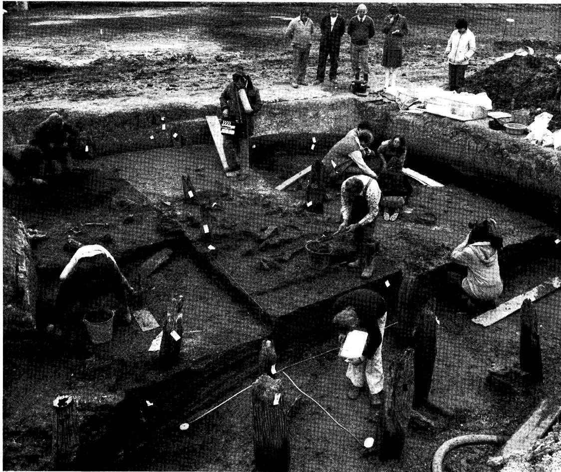
Fig. 10.4: The excavation of Skerne bridge in 1982.

project (Halkon and Millett (eds) forthcoming) It has been suggested that the margins of Walling Fen may have been used as 'water meadows' in a transhumance system (Loveluck forthcoming), but no evidence exists to support the idea. It remains to be seen whether the Humber Wetlands Survey will add anything further to our understanding of this area.