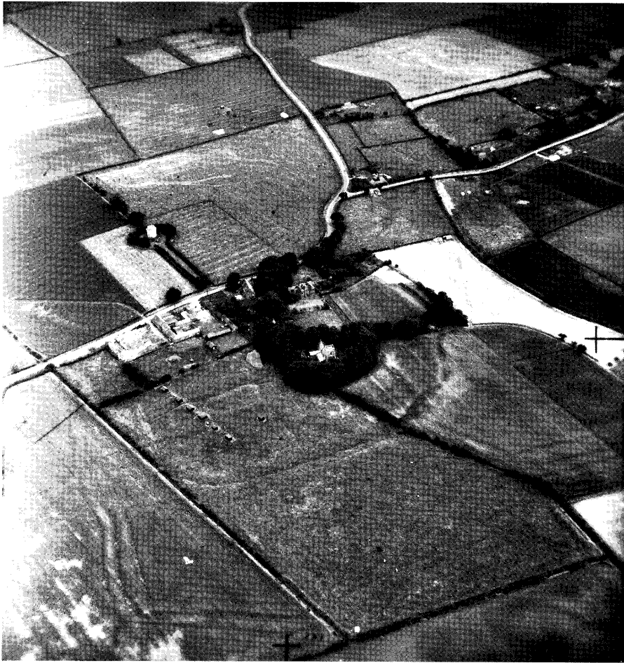
Fig. 10.3: The multivallate site at west Halsham, Holderness, before ploughing.

Summarising this evidence, Evans (1996) points to the presence of many Roman and thirteenth-century and later sites and finds within Kingston upon Hull, but the complete absence of material dated between the fifth and twelfth centuries.