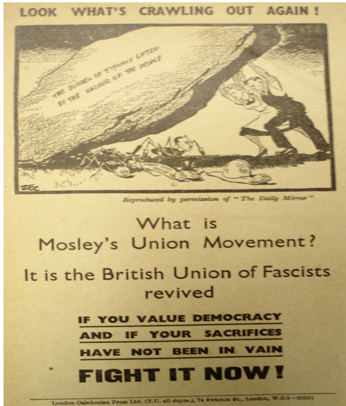
Illustration 4c : 43 Group leaflet. Cartoon was drawn by Philip Zec, who worked with David Low at The Daily Mirror .

the 43 Group was making the public aware that although the names of fascist groups had changed after the war, they were in essence the same as before 1939, with the same leading figures. To the 43 Group, the British Union of Fascists had simply been 'revived'. The Second World War had not killed off British fascism.