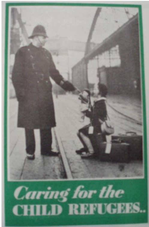
Illustration 3b: GCA: D7501/4/4 Leaflets. Issued by the

Christian Council for Refugees from Germany (not dated).