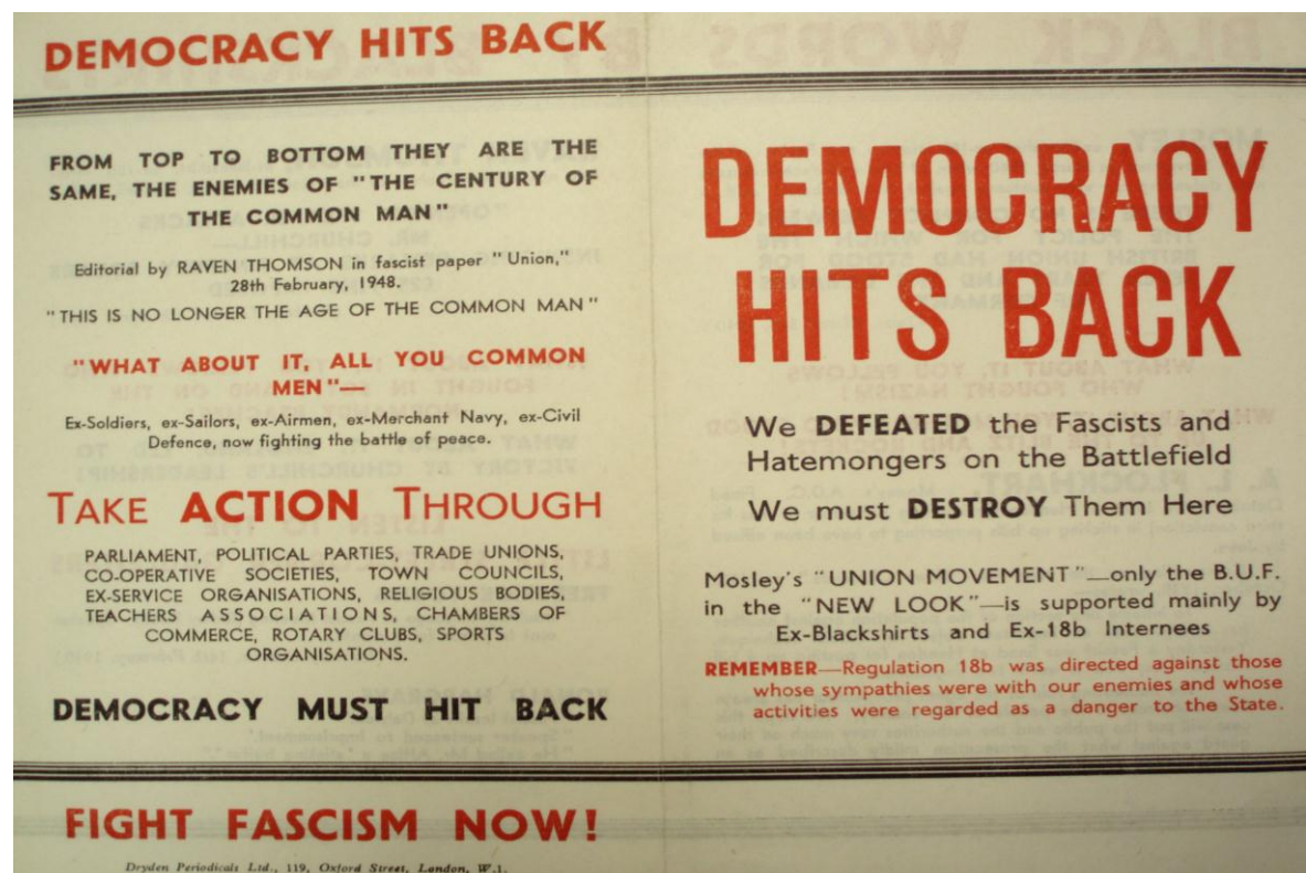
Illustration 4a: Front and back pages of a 43 Group leaflet.

The links made by the 43 Group between the extreme right wing of the late 1940s with pre-war groups and the reason why the war was fought, to destroy German and Italian brands of fascism, is clearly shown in their literature. Both ‘Illustration 4a’ and