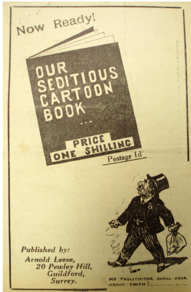
Illustration 4d: Leese leaflet. LSE Archive: File – COLL MISC 1068: 43 Group

supporters were faced with a demonstration by approximately three thousand people, with many members of the 43 Group having infiltrated the fascist meeting. 640 The meeting ended in chaos after demonstrators threw tear gas grenades into the audience.