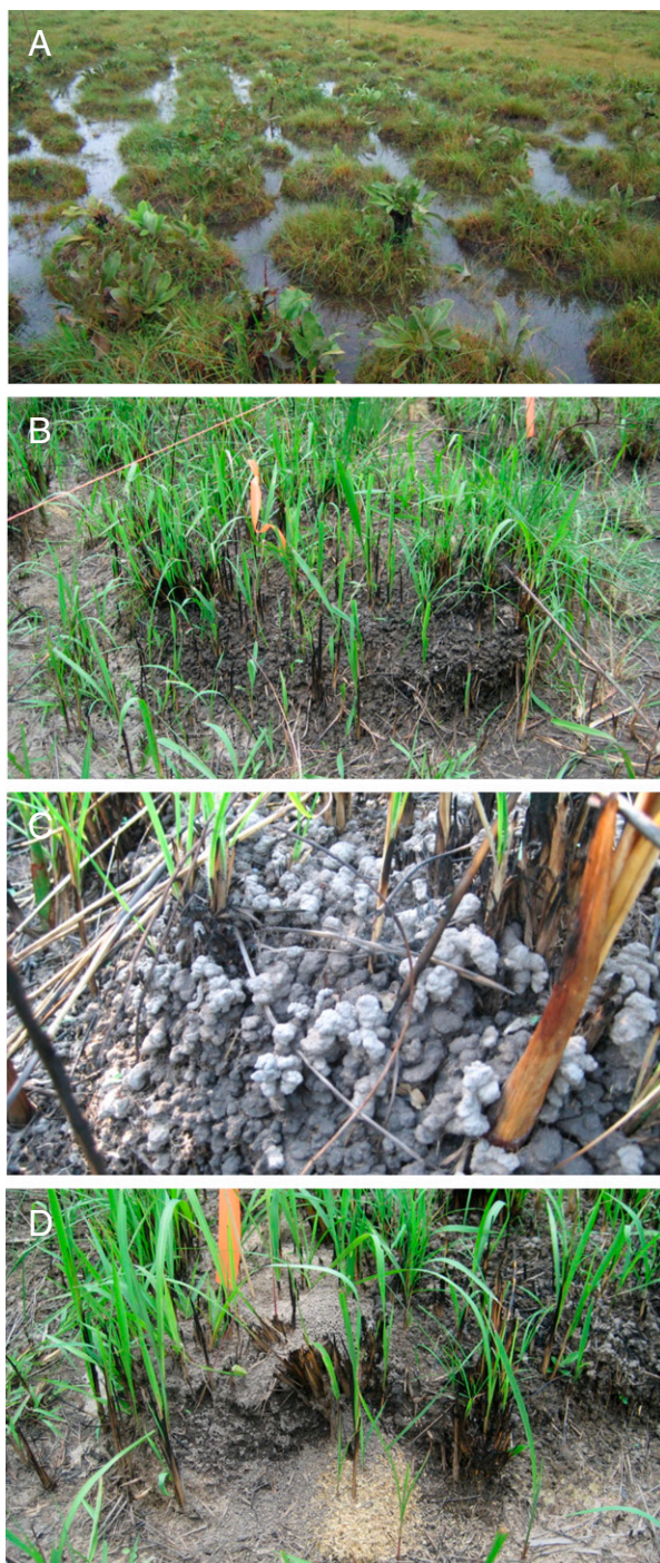
Fig. 4. Raised fields and some of the ecosystem engineers that maintain them. (A) Part of the vast complex of abandoned raised fields in Savane Grand Macoua in the rainy season (April 2007). Only the abandoned raised fields are above water level. (B) Abandoned raised field in the dry season, totally covered with earthworm casts, absent from the surrounding matrix. Note higher plant density on the abandoned raised field. (C) Surface of a typical abandoned raised field, completely constituted of earthworm-produced biogenic structures. (D) Material associated with an Acromyrmex octospinosus nest on an abandoned raised field. Light brown material covering the top of the mound is excavated soil, yellow-brown material at center bottom is plant debris deposited from the ants' fungal farm.

scapes since long before raised fields were abandoned. These central-place foragers move materials to raised fields. Acromyrmex workers carry large quantities of plants to the nest to feed their