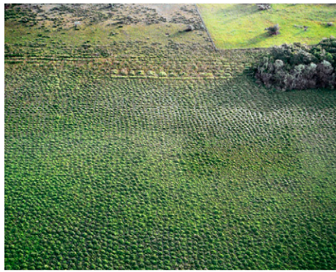
Fig. 1. Pre-Columbian raised fields in Savane Corossy, showing the small, round mounds (most of those figured here are about 1–1.5 m diameter) that characterize many sites. Fig. S1 illustrates the diversity of French Guianan pre-Columbian raised fields and shows the distribution of raised fields along the Guianan coast.

fields to provide crops with well-drained soils in seasonally flooded savannas (5, 26, 27).