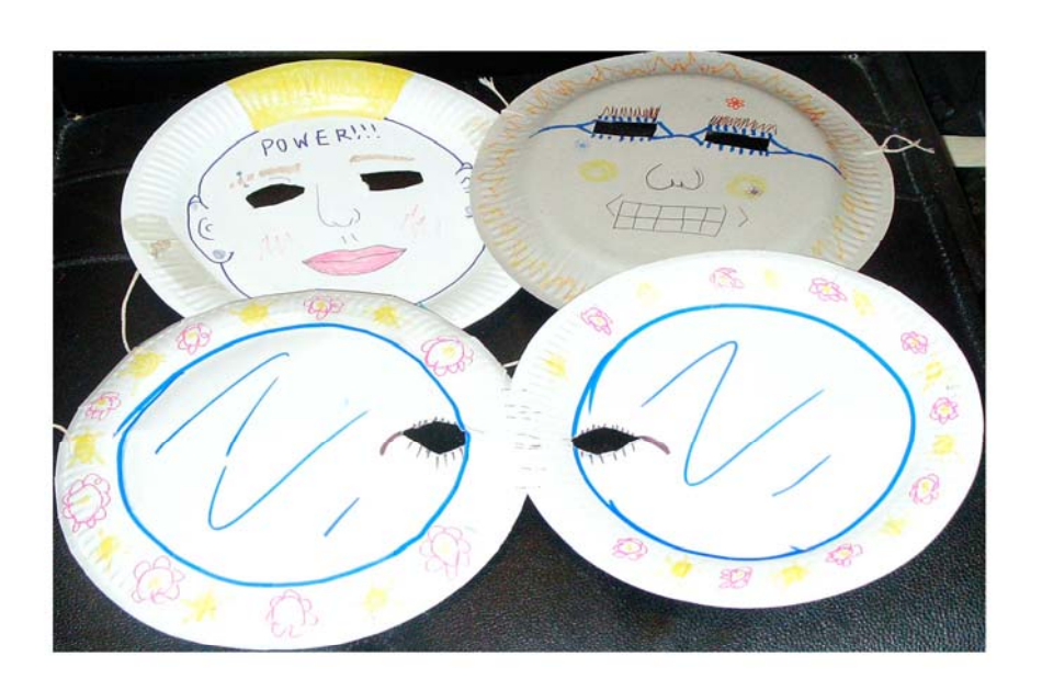
Figure 4. Photographs of masks created by the core group.

Masks created by the core participants in August 2006