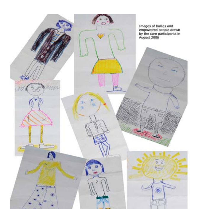
Figure 3. Pictures drawn in collaboration.

Storr (1972) suggests that rituals have a positive effect on young people, offering the beginning of autonomy and a breaking away from the dependence of adults (p. 97). Rituals offer us liberation from oppression while the ceremony helps change people (Schechner 1988).