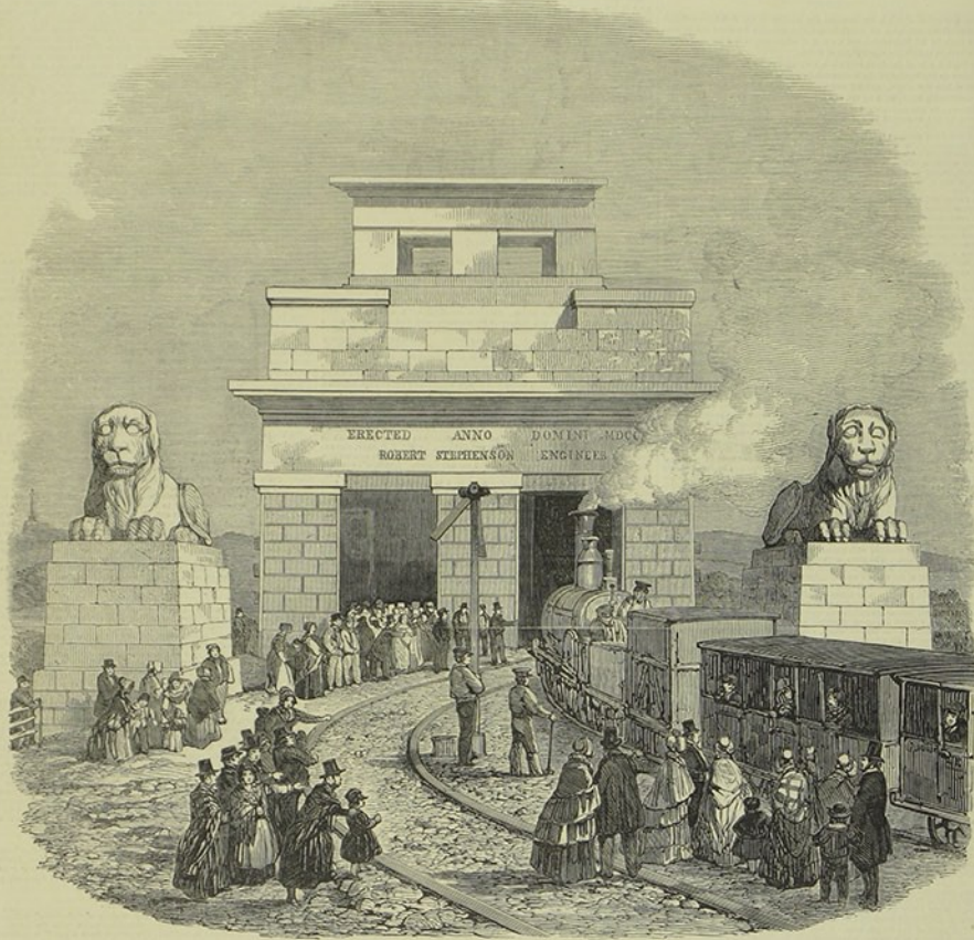
THE BRITANNIA TUBULAR BRIDGE.—ENTRANCE FROM THE BANGOR SIDE.