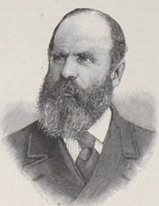
SIR E. BIRKBECK