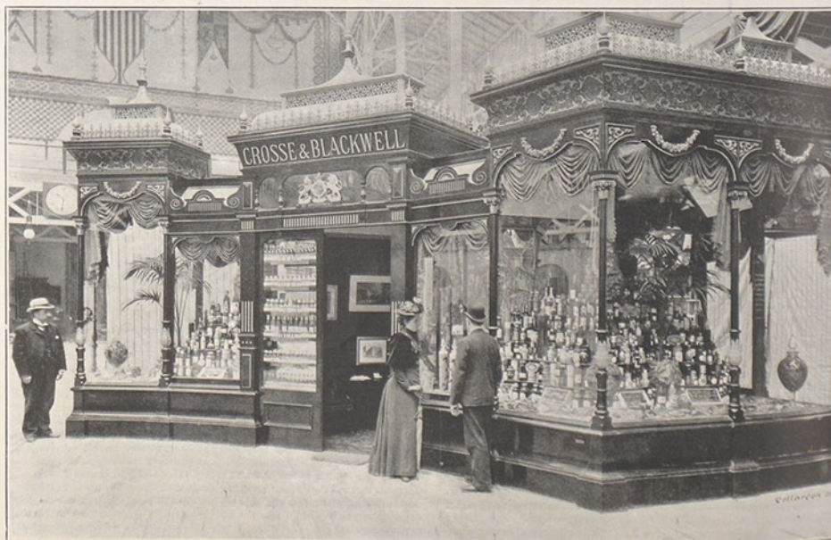
MESSRS. CROSSE AND BLACKWELL'S EXHIBIT IN THE AGRICULTURAL BUILDING

The British section of the Fair has proved certainly not the least interest-