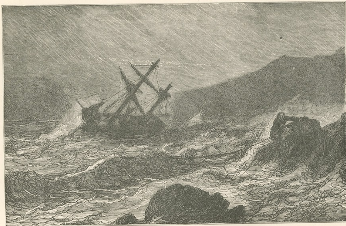
THE "DUGONG" ON THE ROCKS.