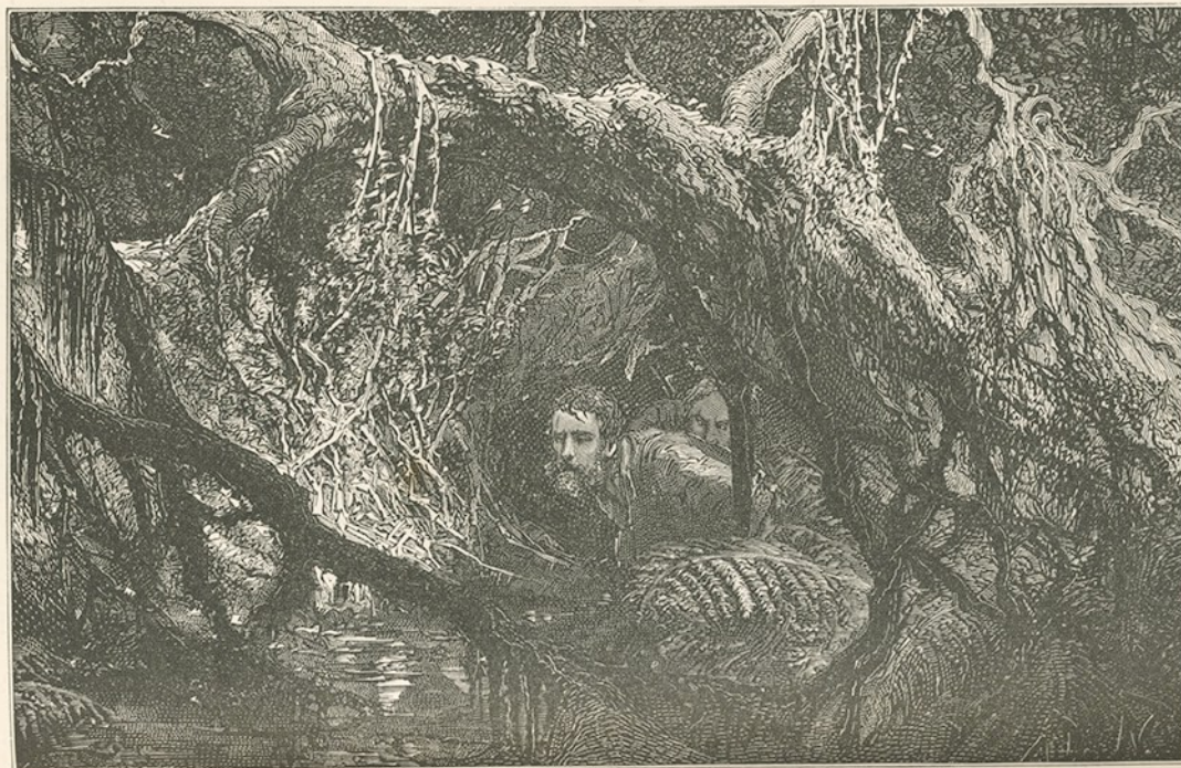
WATCHING THE PIRATES.

s. e r s l, d e r l, o t e d i t s- d, i s h e g- i r e, w a r e s e- d s c h h e y a l y t o r e,