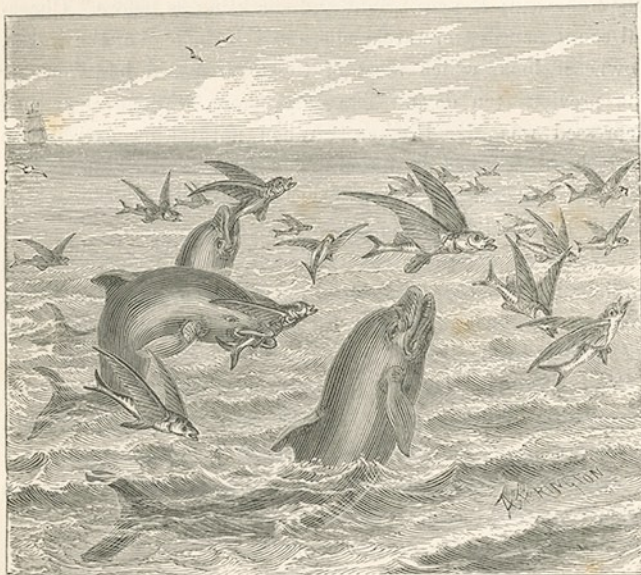
FLYING FISH PURSUED BY DOLPHINS.