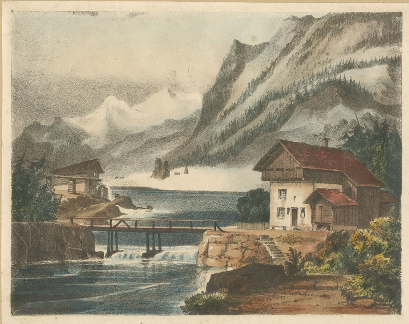
SPOONERS PROTEAN VIEWS No. 4. DESTRUCTION OF A SWISS VILLAGE BY AN AVALANCHE. The Village is seen by Moonlight, the inhabitants, by the lights gleaming from their casements & reflected on the Lake are not yet retired to their beds. The Morian glair brings to view the destruction of the Mill - an Avalanche has buried in a split the village leaving but the Spire of the Church and the Tower of the Castle to mark its situation. LONDON. W. SPOONER 377, STRAND.