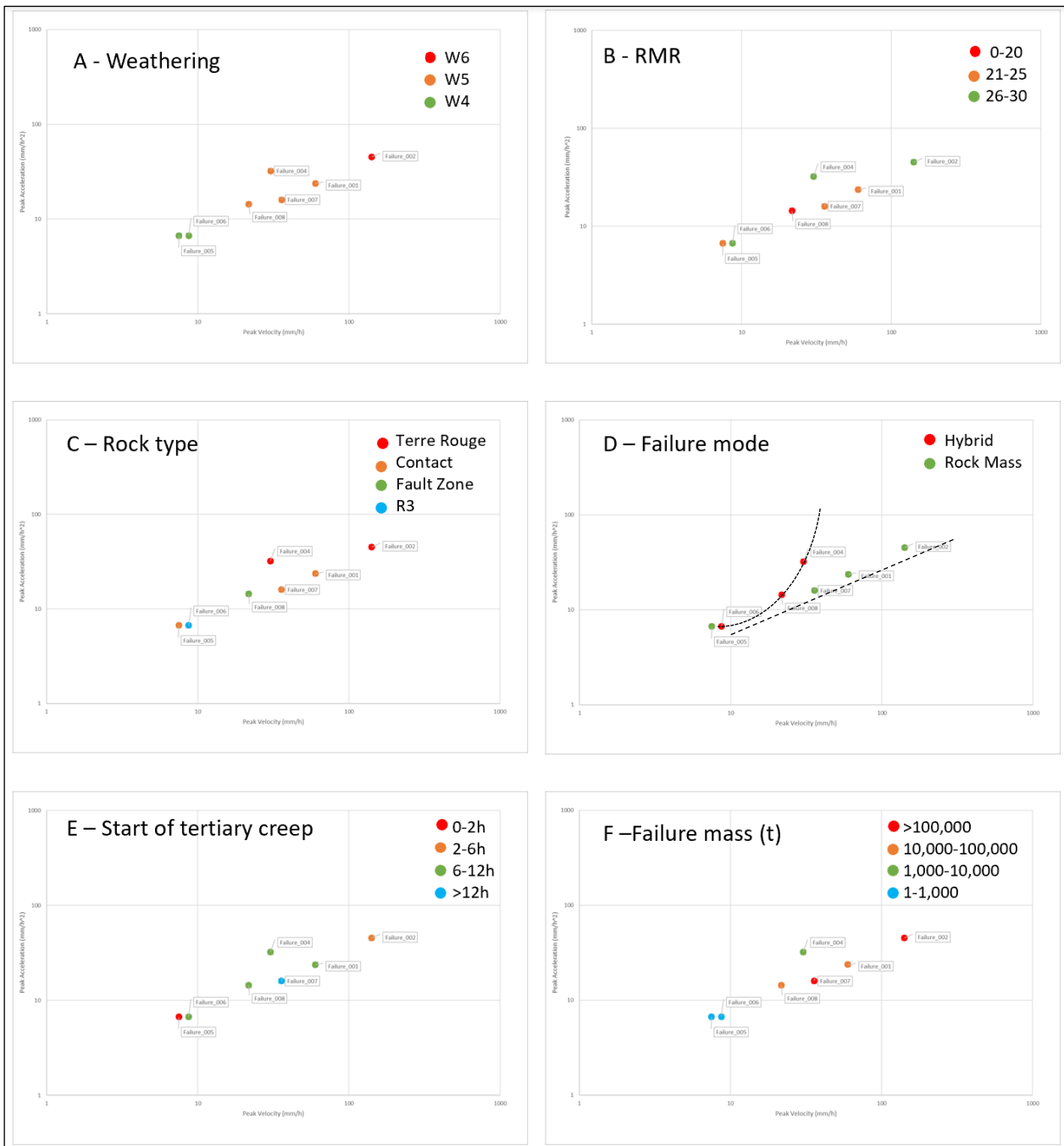
Figure 3. Analysis of log-velocity vs log-acceleration for study site examples for weathering, RMR, rock type, failure mode, start of tertiary creep and failure mass. NB, the trend lines indicated in Figure 4 D are approximations

Based on the log plots and statistical analysis a TARP was developed for the study site with the aim of triggering alarms 12–24 hours prior to collapse (Figure 4). The TARP compares two variables, velocity and estimated failure size to ensure mitigating actions are implemented proportional to the risk posed by the potential failure. The two variables were selected as they have a positive correlation, visual analysis grouping and both can be practically implemented. Weathering was omitted from the TARP as the slopes were all moderately to completely weathered and therefore expected to behave similarly. However, as the pit progresses it is recommended that areas of the slopes which are less weathered have separate thresholds developed. Since the implementation of the TARP all failures successfully triggered alarms at an early stage and progressed through the risk matrix as the velocity rates increased. Appropriate and