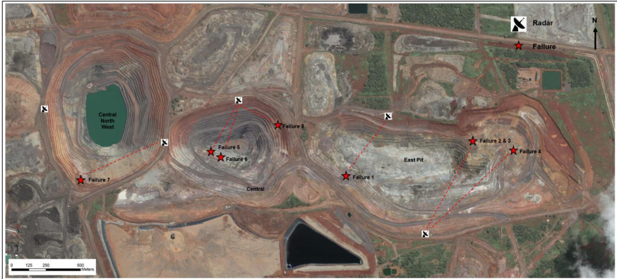
Figure 1. General layout of the open pits at the site with the locations of the SSR units and slope instability events.

The open pit mine study site is located within the African Copperbelt, in the south-eastern part of the Democratic Republic of Congo and has been operating since 2006. At the time of writing the site operated three open pits (Central-North West, Central and East Pit). Figure 1 outlines the general layout of the study site indicating the location of the respective open pits, SSR's and slope instability events.