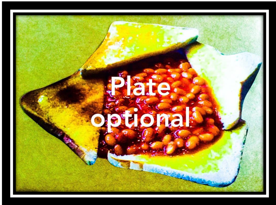
Figure 1: E Hall, Plate optional , 2019. Digital image.