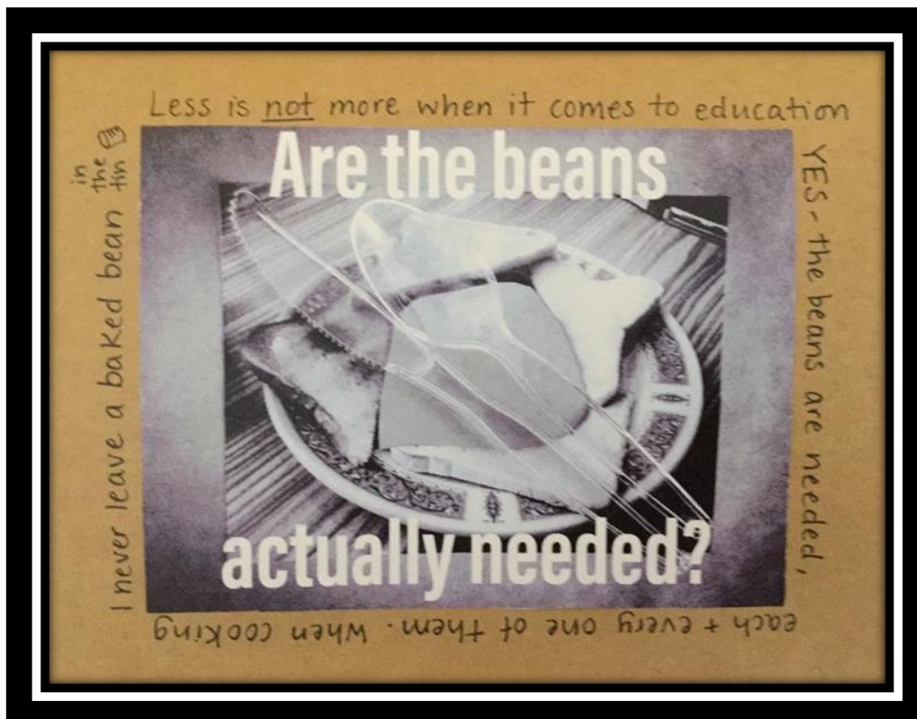
Figure 6: E Hall, Are the beans actually needed? , 2019. Digital image with annotations.