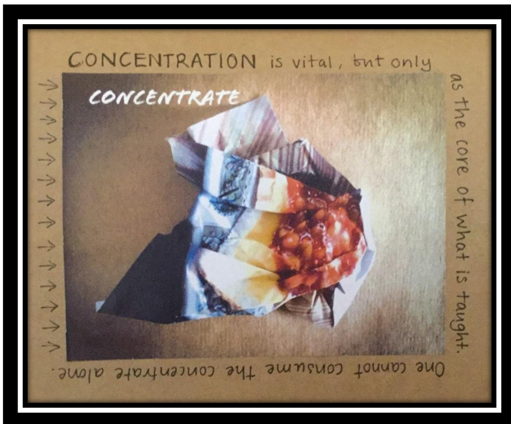
Figure 4: E Hall, Concentrate , 2019. Digital image with annotations.