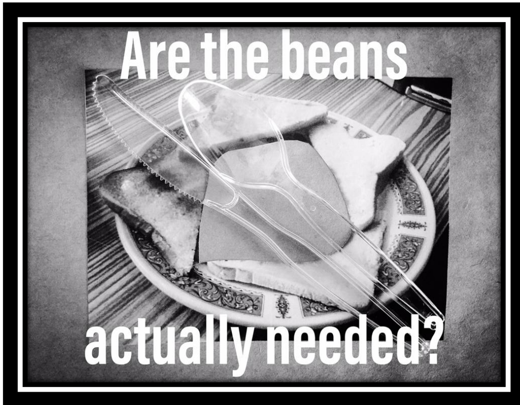
Figure 5: E Hall, Are the beans actually needed? , 2019. Digital image.