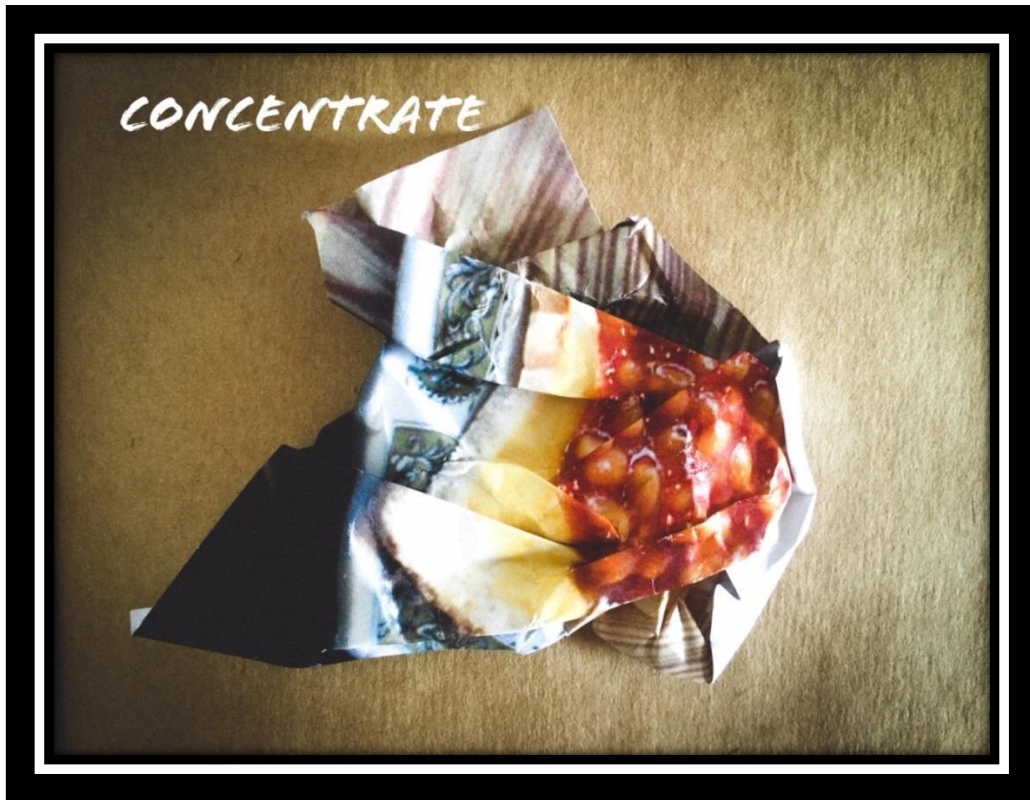
Figure 3: E Hall, Concentrate , 2019. Digital image.