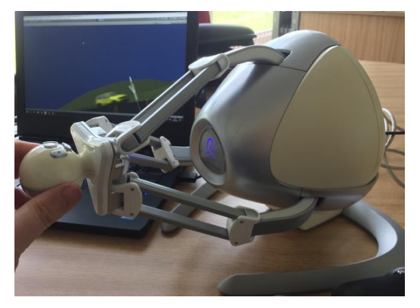
Figure 3: The Novint Falcon being used to control a virtual needle in ParaVR

For haptic feedback, the VR simulator has also been combined with a Novint Falcon haptic device (Fig. 3). This provides three degrees of freedom (DOF) force feedback. As the learner moves the hand-held controller on the end of the interface, then the virtual needle follows its movement in the virtual world. This provides more fidelity for needle insertion as you can feel the sensation