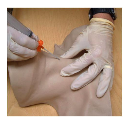
Fig 1. Part-task resuscitation trainer for NCCT (Perkins, 2007).

We found some basic existing simulation devices for general resuscitation which can support needle cricothyroidotomy among other procedures (Fig. 1). These are simple part-task or procedural trainers which are most commonly used to develop a basic psychomotor skill. No measurements were presented to demonstrate how realistic the feeling is compared to a real procedure on a live human.