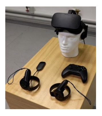
Figure 2. The Oculus Rift HMD with its interaction devices including wireless hand controllers

In our working prototype VR training simulator, the Oculus Rift head mounted display (HMD) was used. The Rift comes with wireless hand controllers (Fig. 2) which can be used by the learner or trainer to interact with the virtual model, pick up needles and insert the needle into the virtual patient. Although the learner is holding the controllers, only a model of a human hand is rendered in the virtual