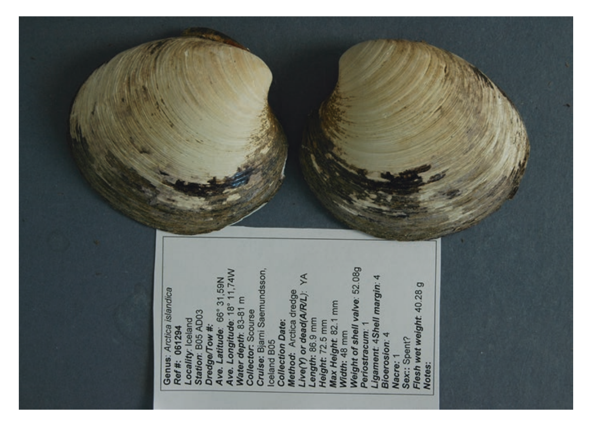
Fig. 21.3 Shell valves of a 507-year old specimen of Arctica islandica collected near Grimsey island, north of Iceland in 2006, with processing notes.