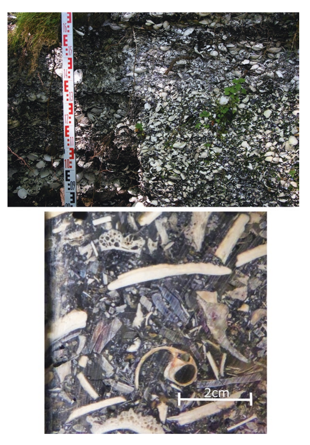
Fig. 21.2 (top) Shell midden excavation in progress from the Salish Sea, southern British Columbia. (Photo: Terence Clark); (bottom) Intact sediment block from a shell midden embedded with fiberglass resin, north Calvert Island, British Columbia, Canada. (Photo: Meghan Burchell)