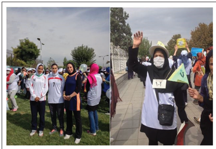
Figure 6. Left: football players from the Iranian National Team; right: a former homeless addict chanting at the marathon.

later all fellow Iranians – to bring warm clothes, food and other essential items for those in need.