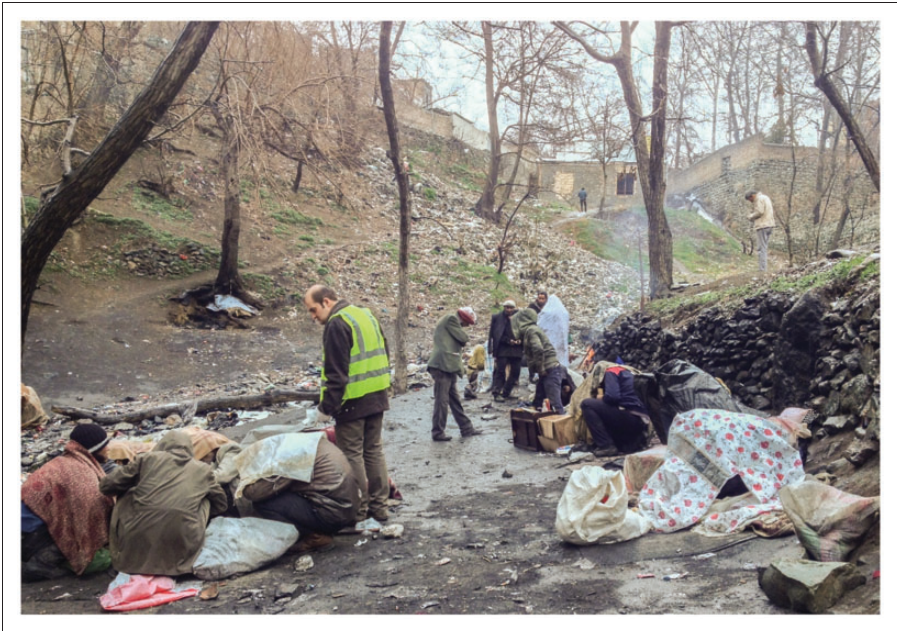
Figure 1. Chehel Pelleh.

Security in the patoq is guaranteed by a number of gardan kolofts , ‘roughnecks’ who act as vigilantes in the drug hotspot. They consist of look-outs, informers, but also enforcers of the local order. They carry clubs and knives but no gun, at least