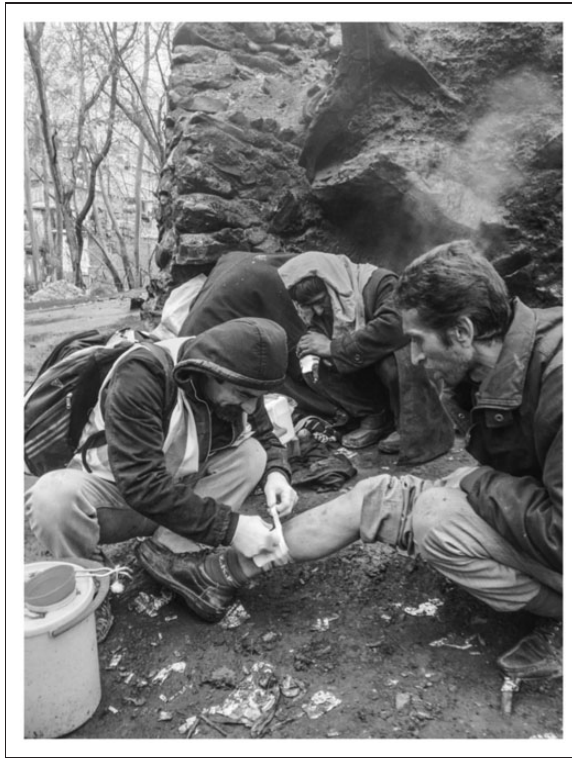
Figure 2. Harm reduction in Farahzad Valley.

according to the widespread belief of those in the surroundings. The boss of the patoq pays them a daily wage for their services, mostly in the form of drugs, which they re-sell, or limited monetary compensation, or a combination of both. Strangers are dissuaded from passing through the patoq for fear of being taken for undercover cops or informants. This applies at times also to humanitarian groups, such as outreach activists who provide clean needles, condoms and primary healthcare to the people there. On one occasion, following an earlier police busting operation in the area, one of the vigilantes threw a heavy wooden club at me from uphill shouting ' boro gomsho ****! ', 'get lost, ****!'. Suspicion and distrust towards strangers is the rule, a fact that undermines also health initiatives among people using drugs, especially injectors and sex workers (Figure 2).