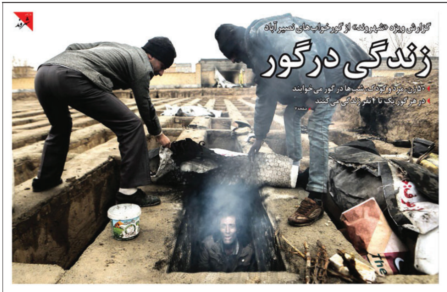
Figure 4. Front-page of Shahrvand: 'Life in the Grave'.