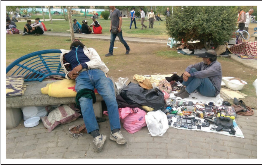
Figure 7. Harandi Park: street vendors, street addicts.

to symbolically recover the body of the park from the sight of widespread drug use and destitution. Truth be told, the event revealed itself to be not a marathon – not even close – but rather a public demonstration that brought more than a thousand women and their sympathetic supporters (like myself) to march inside the park and in the middle of the gathering of drug users, among whom there were dozens of women. The term ‘marathon’, I thought, was probably used to get around the politicisation of the event in the eyes of the municipality, which could have regarded a women-led march against drugs as too sensitive a topic.