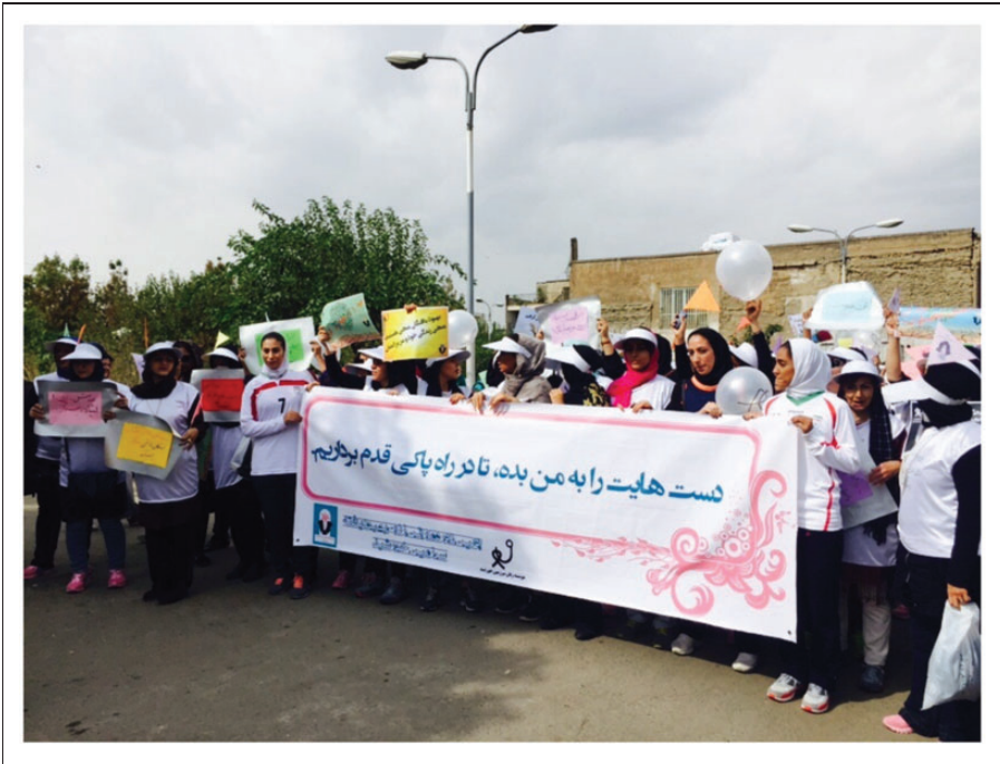
Figure 5. ‘Marathon’ in Harandi Park.

don’t sell anything except nakh ‘oqabi [one fag of Winston Red , popular brand for homeless and hashish smokers] laments a shop owner in Darvazeh Ghar. He adds ‘Even mothers who come here buy just half a kilo of lentils; no yogurt, no milk. Here, harf-e avvalo e‘tiyad dare! [Here, addiction runs the place!].’