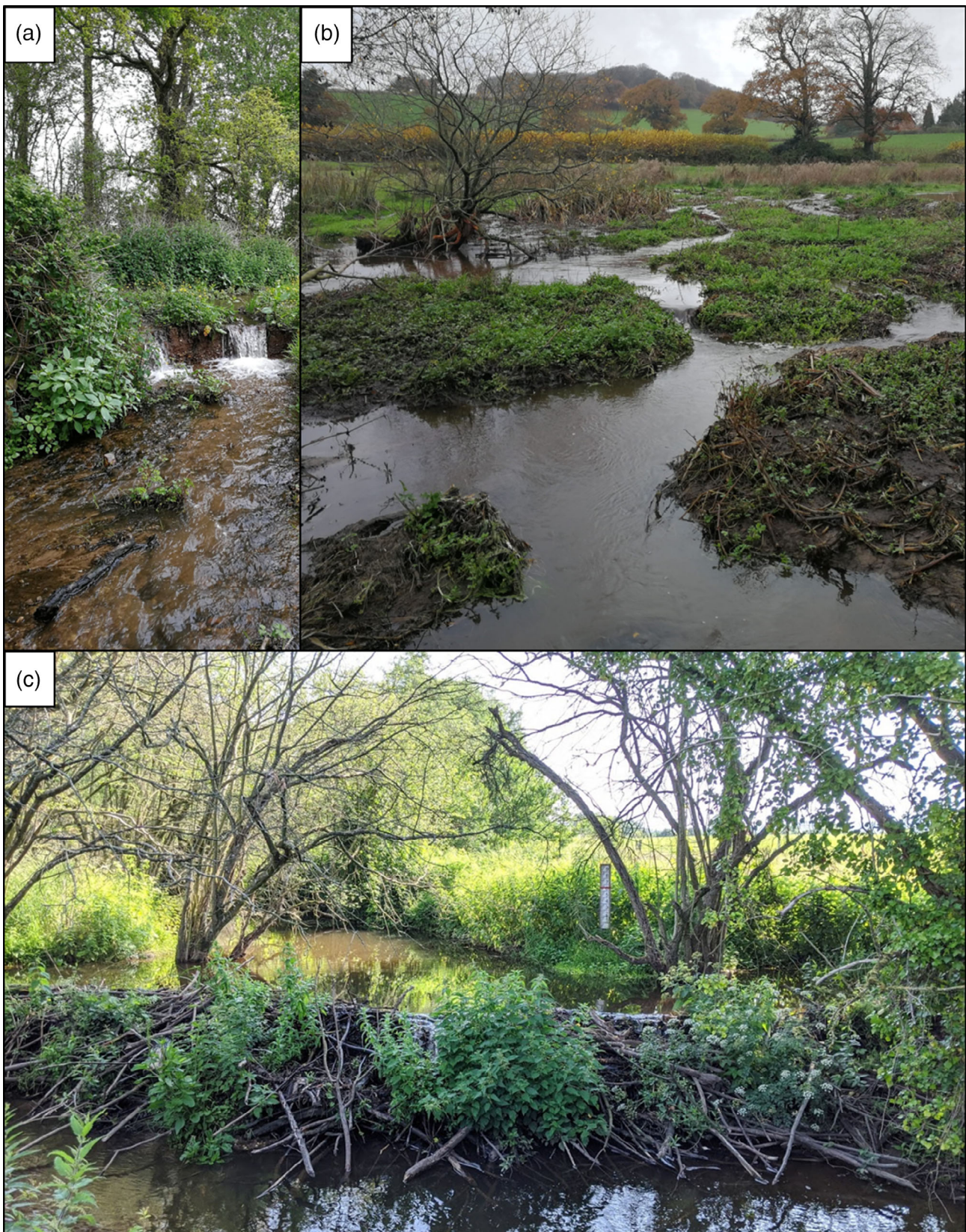
FIGURE 1 Examples of dam construction and channel avulsion resulting from beaver dam construction from the River Otter catchment, England. Panel (a) shows an example where a divergent flow path has re-entered the main channel resulting in head-cut erosion. Panel (b) shows the type of multi-thread channel form that occurs downstream of dams in wide, low gradient floodplains. Panel (c) shows a beaver dam on a 4th order stretch of river.