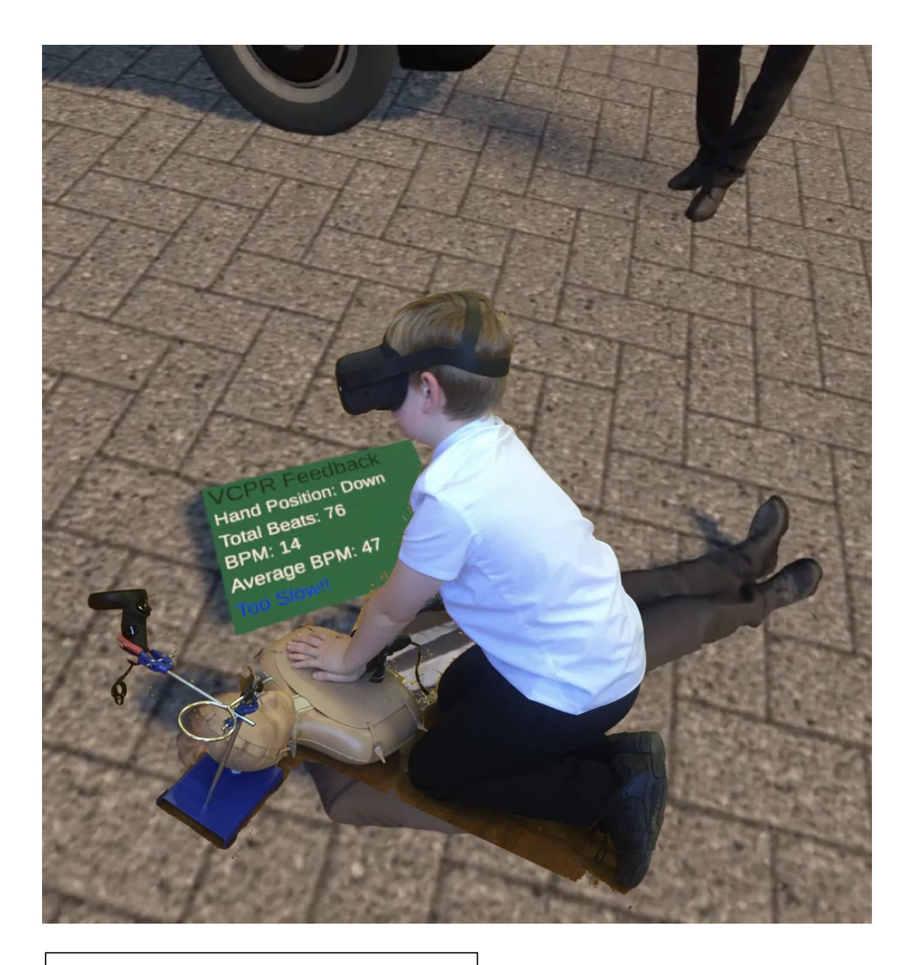
Figure 3. The VCPR training environment in use. The real and virtual worlds have been superimposed for illustration purposes.