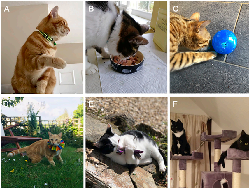
Figure 1. Treatments Applied to Domestic Cats to Reduce the Numbers of Wild Animals Captured, Brought Home, and Recorded by Householders

(A) Bell: cats are fitted with a collar-mounted “standard” cat bell.