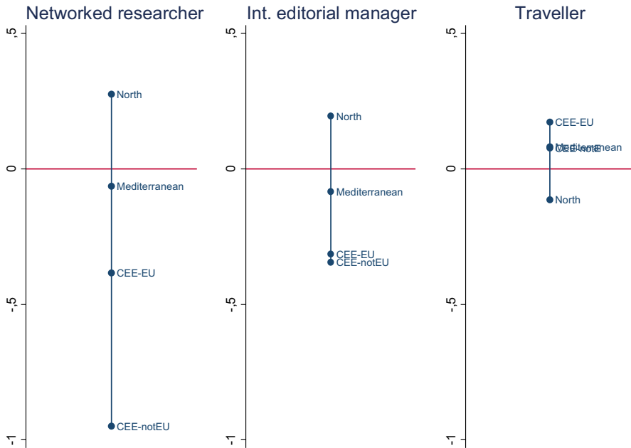
Fig. 1 The three types of international political scientists, by geographical area. Note: standardised values (1 means one standard deviation above or below the average).