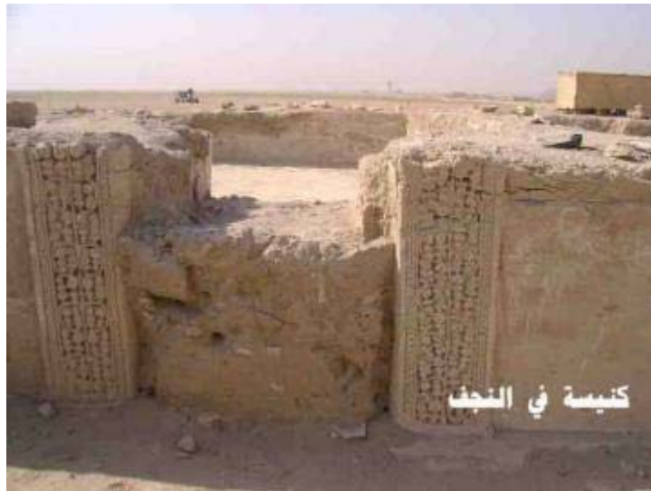
Remains of Christian Church discovered recently in Najaf