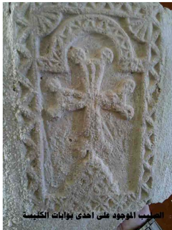
Cross appears on a church discovered in Najaf, Source: www.najaf-news.com , al-Najaf News