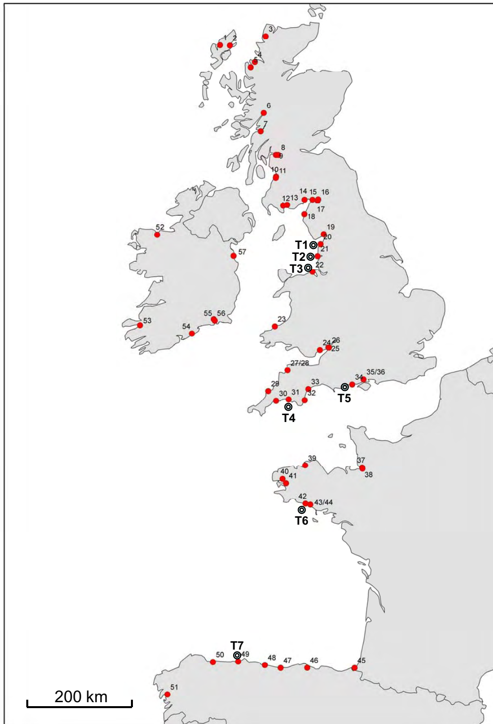
Figure 1 Map of the river mouth locations for rivers included in the project. Key to catchments analysed: (1 - 15, Scotland) 1: Blackwater; 2: Creed; 3: Laxford; 4: Gruinard; 5: Ewe; 6: Loch Lochy; 7: Awe; 8: Loch Lomond; 9: Clyde; 10: Ayr; 11: Doon; 12: Cree; 13: Fleet; 14: Nith; 15: Annan; (16 - 36, England and Wales) 16: Esk; 17: Eden; 18: Derwent; 19: Kent; 20: Lune; 21: Ribble; 22: Dee; 23: Teifi; 24: Usk; 25: Wye; 26: Severn; 27: Taw; 28: Torridge; 29: Camal; 30: Fowey; 31: Tamar; 32: Dart; 33: Exe; 34: Avon; 35: Itchen; 36: Test; (37 - 45, France) 37: Sée; 38: Sélune; 39: Léguer; 40: Élorñ; 41: Aulne; 42: Ellé; 43: Scorff; 44: Blavet; 45: Nivelle; (46 - 49, Spain) 46: Asón; 47: Cares; 48: Sella; 49: Narcea; 50: Eo; 51: Ulla; (52 - 57, Ireland) 52: Moy; 53: Laune; 54: Cork Blackwater; 55: Barrow; 56: Suir; 57: Boyne. Full details of catchments studied are given in Additional File 1.