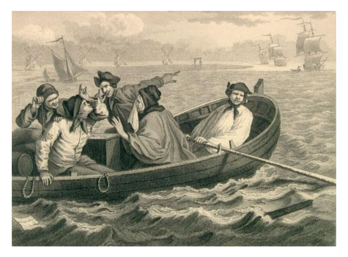
Figure 5. William Hogarth, The Idle 'Prentice turn'd away and sent to sea, c. 1747

By Teonge's day the rod had been replaced with a whip, but the effect was the same. Both writers described 'Black Monday' in much the same spirit as