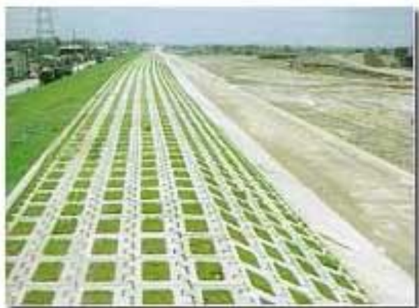
Figure 5. Dike construction employing ecology methods