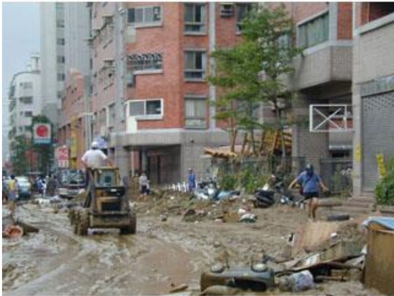
Figure 4. People deal with enormous waste after the storm Typhoon Nali.