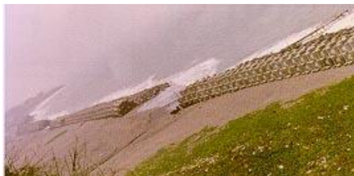
Figure 7. Coastal protection along Ginshan beach in Taipei County