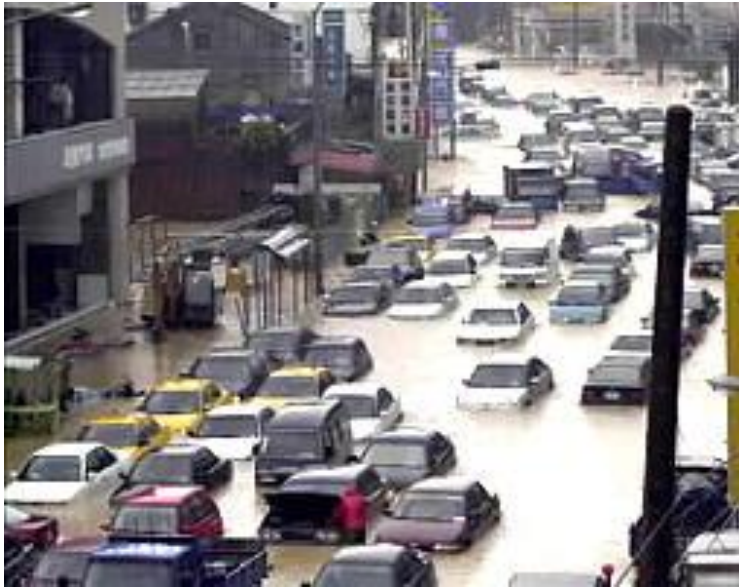
Figure 3. Numerous cars were submerged in the storm Typhoon Nali.

Please cite as: Teng WH, Hsu MH, Wu CH, and Chen AS (2006). Impact of flood disasters on Taiwan in the last quarter century. Natural Hazards, 37(1-2), 191-207, DOI: 10.1007/s11069-005-4667-7