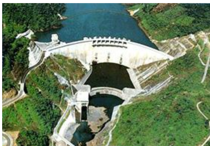
Figure 6. Overview of the Feidui reservoir in Taiwan