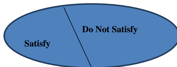
Figure 1: Partitioning the set of objects

1.2.1 The purpose of a definition is to allow the object being defined to be identified. That is, a definition makes it possible to distinguish objects that meet the definition from objects that do not. In formal terms, a definition should provide a partition of the set of all objects into the set of those satisfying the definition, and the set which do not. This is the equivalent to the observation of Copi and Cohen (1990) “The principal use of a definition, in reasoning, is the elimination of ambiguity.” This is illustrated schematically in Figure 1.