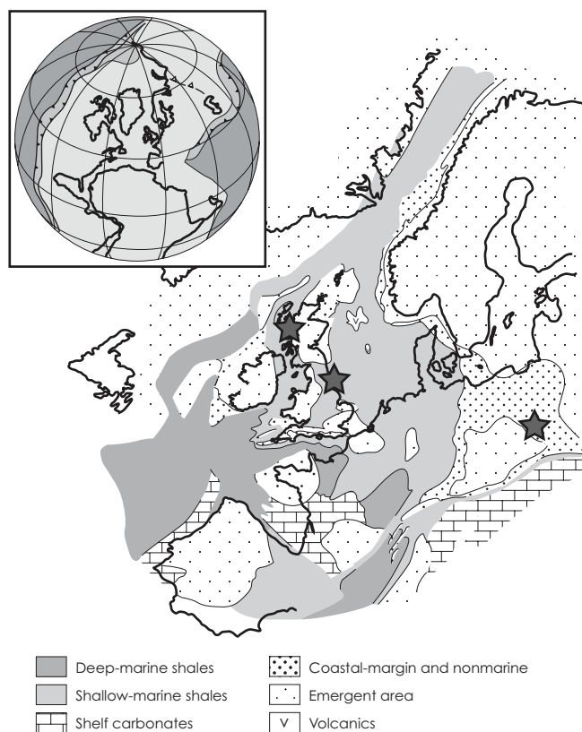
Figure 1. Palaeogeography for the UK and Polish localities (stars represent sampled localities). Inset: Global paleogeography of the Early Jurassic. Modified from Coward et al. (2003).

For the present study we discuss 411 oyster values and 665 belemnite values (Fig. 1; supplemental item 1, 2). These comprise ~550 new analyses from stratigraphically well-defined Hettangian to Bajocian successions of the UK, together with published data for these successions and from the Bathonian to Callovian of Poland. Sedimentology, stratigraphy and biozonation for the UK (supplemental item 1) are described in Taylor (1995) and Hesselbo et al., (1998), and for Poland in Wierzbowski et al. (2012). Analytical results were pooled for ammonite biozones to compute statistically meaningful mean values at a temporal resolution of ~1 Myr (Fig. 2a; supplemental item 1,2).