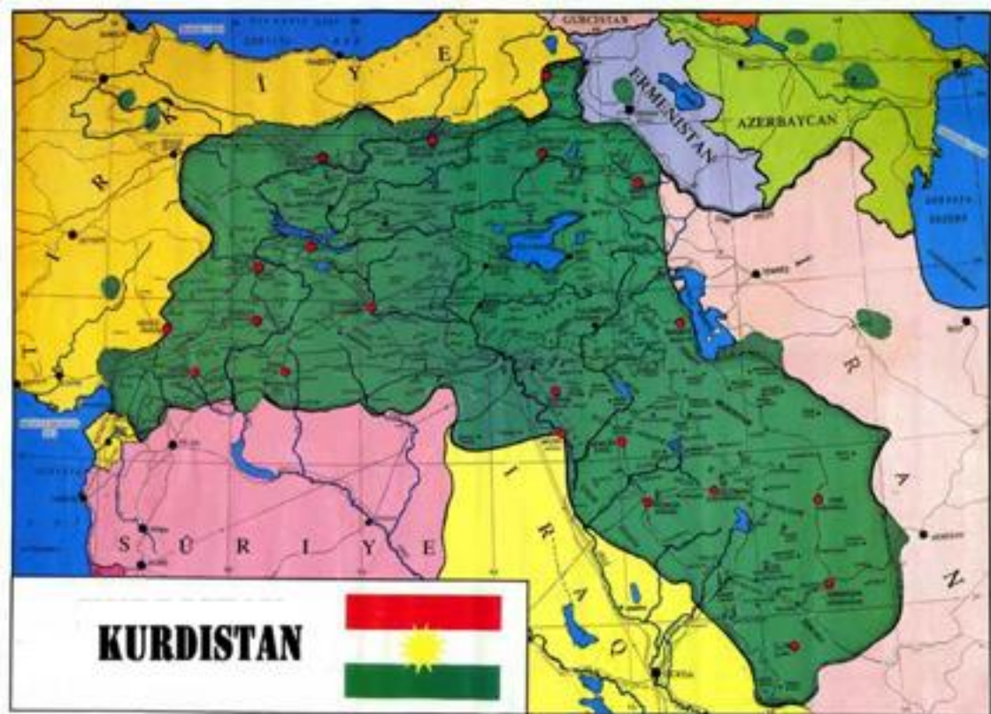
The map of Kurdistan ( http://www.ardalan.org/about.html )

No-one has ever claimed that those metropolises are Kurdish areas, however, the vast number of the Kurds living in those cities; make them very important for the Kurdish struggle and the social and political movements of the Kurds. For instance, Istanbul is sometimes considered as the biggest Kurdish city rather than Diyarbakir or Erbil, since there are around three to five million Kurds living in Istanbul, according to some informal information from Kurdish political parties. Moreover, there are large Kurdish communities living in countries of the former Soviet Union, such as Armenia, Azerbaijan, Kazakhstan, Kyrgyzstan, Russia and several other countries. Also there are more than two million Kurds in Europe and the USA, and more than a million in Germany alone, (interview with A7 on 05/08/2011).