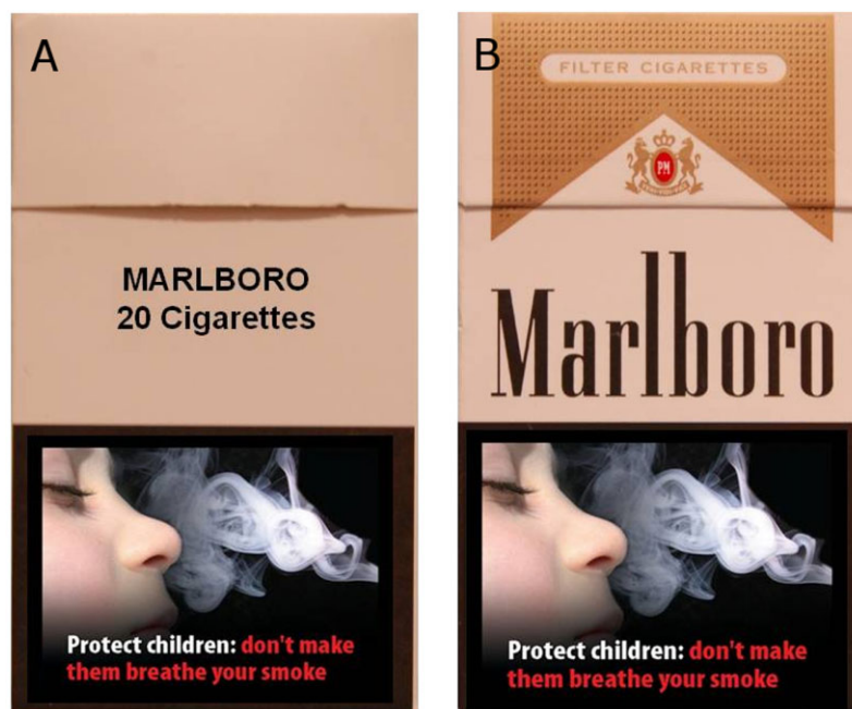
Figure 1 Examples of the cigarette pack stimuli presented on-screen prior to choice between the tobacco- versus chocolate-seeking response in the Pavlovian to instrumental transfer (PIT) test: (a) plain pack; (b) branded pack

daily. Participants were sampled in this way to ensure a normal distribution of individuals across the continuum of smoking heaviness indexed in these studies by cigarettes smoked on smoking days. All participants were asked to abstain overnight from smoking prior to completing the study, and compliance was checked with breath carbon monoxide (CO) measurement and self-report. Participants were debriefed and reimbursed £5 for their time and expenses, and ethical approval was granted by the University of Bristol, Faculty of Science Research Ethics Committee. We calculated the required sample size for experiment 1 to demonstrate a PIT effect produced by the branded cues, on the assumption that the effect size would be similar to that observed for the cigarette cues used in a previous published study [13]. This effect size ( d_z = 0.79 ) indicated that a sample size of n = 24 would provide 95% power at an alpha level of 5%.