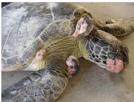
FIGURE 1 | Green turtle showing externally visible signs of fibropapillomatosis (FP). This image was shown to fishers during interviews.

This study took place over two years between November 2008 and December 2010 in the TCI, a UK Overseas Territory in the Caribbean (21°45N, 71°35W). Here, there are minor hawksbill turtle ( Eretmochelys imbricata ) and minor green turtle nesting populations (Stringell et al., 2015), yet regionally significant foraging aggregations of both species (Richardson et al., 2009). The islands have numerous creeks and shallow muddy-sand banks that offer extensive seagrass habitat ideal for foraging green turtles. The research team was stationed on South Caicos, the main fishing center of TCI, for the duration of this study. Regular visits were made to the islands of Grand Turk and Providenciales, the two main population centers, and several visits were made to North and Middle Caicos (Figure 2).