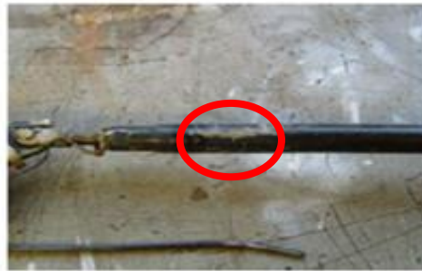
Figure 12 Paint damage to the pitch control rod in the area co-incident with the buckle location shown in Figure 11