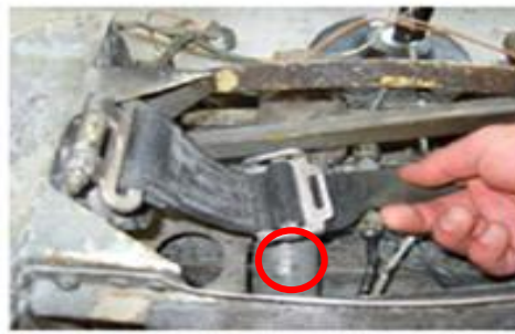
Figure 11 Crotch strap from [redacted] positioned in a similar manner to that shown in Figure 10. Paint damage was present to the upper and lower edges of the longitudinal structural member and on the upper section of the flap actuator casing. (Pitch control rod omitted)