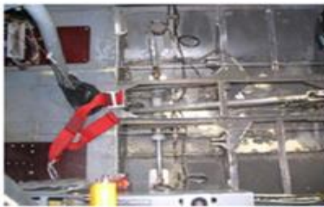
Figure 9 View of structure beneath rear seat position of a similar aircraft to [redacted] showing controls with right roll applied

He was certain that it was not in the pilot's nature to carry out aerobatics at low level: so certain that he asked the AAIB for permission to inspect the wreckage of the aircraft. This had completely disintegrated forward of the rear cockpit. However, from the wings back, the strongest structural part, the fuselage floor was intact although badly deformed.