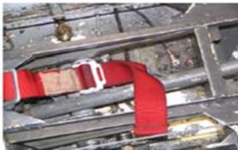
Figure 10 View showing crotch strap buckle jammed between the pitch control rod and fixed structure on a similar aircraft to [redacted] with left roll being demanded but with the control stick positioned to the right