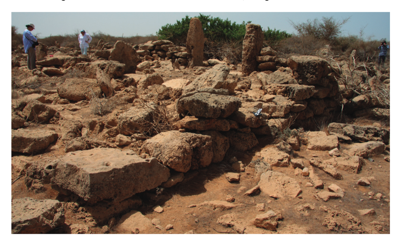
Figure 3. A general view of the Wadi Matar Bā° site, on which the anchor was found.

suggest that it has been shaped from a flat slab, the sides being cut using a metal implement. No tool marks were visible on the top surface. The holes themselves appeared to have been carved through in one direction from one side to the other, using a metal chisel.