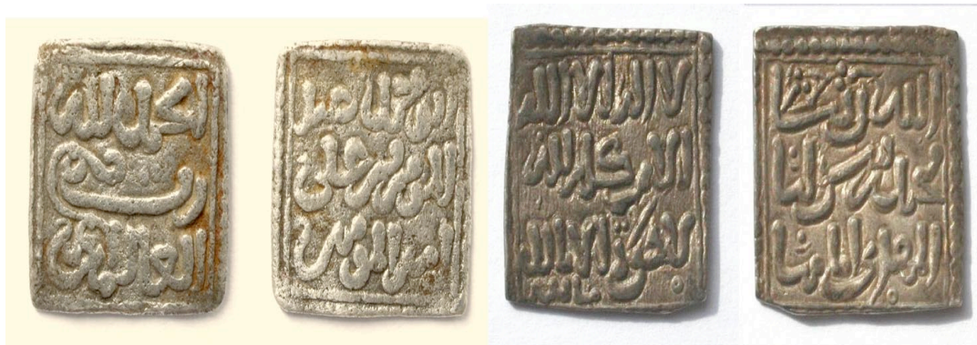
Figure 14: Two Dirhams minted during the period of 'Abd al-Mu'min b. 'Alī 181

When the name of the mint appears, it does so positioned under the legend on the back. A number of cities in al-Andalus are mentioned in these pieces: Valencia, Dénia, Granada, Seville, Jaén, Málaga, Menorca, Mallorca, Murcia, Córdoba and Jerez. 180