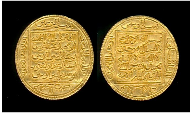
Figure 12: Dinar minted during the period of Muḥammad al-Nāṣir 169