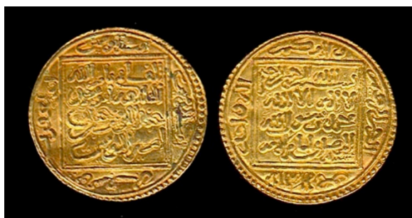
Figure 10: 1/2 Dinar minted in Seville 163

Again, Seville is the only city in al-Andalus that is named on the dinars from this period. 162