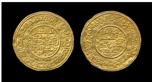
Figure 7: Dinar, minted in Jaén 153

While the phrase that can be read on the border is the "Prophetic Mission".