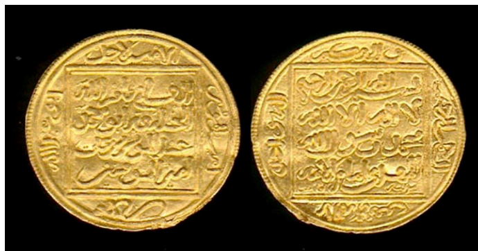
Figure 9: 1/2 Dinar minted in Fes 160

As in the case of dinars in the first phase, the name of the mint, if present, is stamped in smaller characters in either a position that is above or below the central legends.