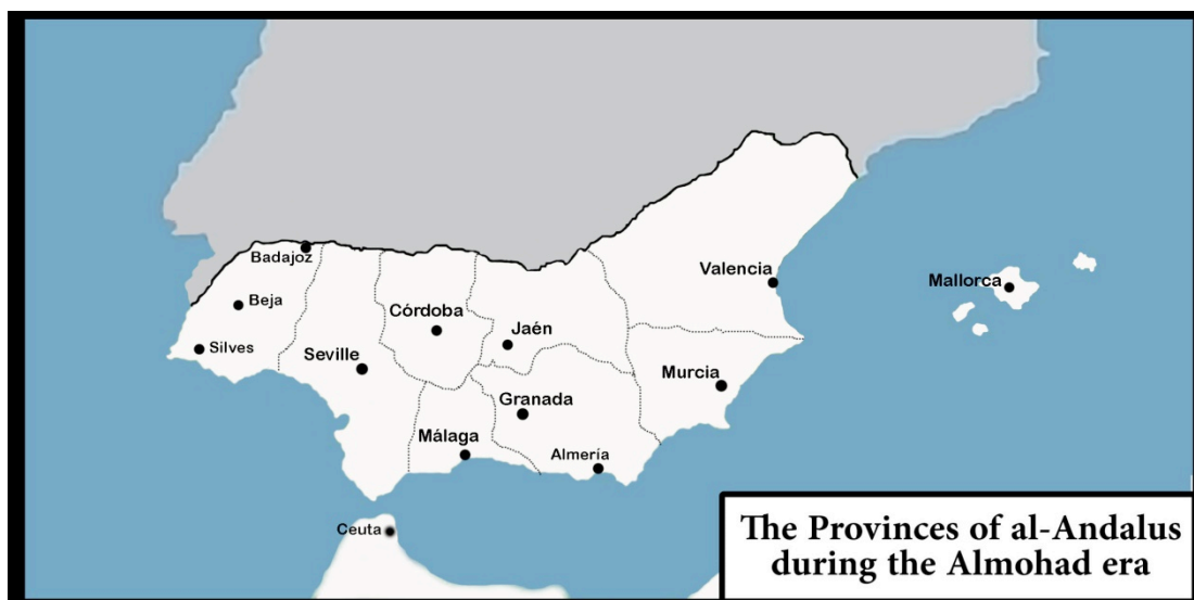
Figure 6: The Provinces of al-Andalus during the Almohad Era

At the head of the administrative offices in each province, there was a wālī (governor), who lived and had his headquarters in the al-qaṣaba (the term for a walled fortification, from which the Spanish term Alcazaba was derived). 10 This official represented the leader of the Almohad dynasty in the province, and under his authority were the governors of all of the cities in the Kūra . Below the governor, in all of the provinces, there were offices for official correspondence, judicial affairs, and tax collection. All expenses were covered by money collected from people in the province: legal fees, extraordinary contributions, taxes, fines, and any other special expenses that the government decided to undertake. It was expected that the money collected in every province should cover its military spending and pay both the ‘aṭā’ (salaries) of the