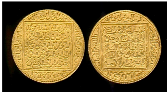
Figure 13: Dinar minted during the period of Abū al-‘Ulā Idrīs b. Ya‘qūb 173

The adjustments to the "double dinars" of this sixth phase were associated with the reign of Abū al-‘Ulā al-Ma‘mūn (1227-1232), the last Almohad Caliph with effective power that was connected with al-Andalus. 170 In the legends of the two known types of "double dinars" the tradition of expression, to make known the long list of names of their predecessors, and the omission of the passage from the Koran continues. One of the copies introduces the term al-Mujāhid al-Ma‘mūn as an epithet for the Caliph Abū al-‘Ulā. 171 The expression Ibn al-khalīfatayn appears on both coins and differs only in respect of their distribution of the legend. 172