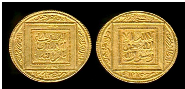
Figure 8: 1/2 Dinar minted in Córdoba 155

4 th . Segment: al-ḥamd li-Allāh rabbu al- 'ālamīn.