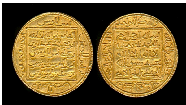
Figure 11: Dinar minted during the period of Ya'qūb al-Manṣūr 167

As has become apparent, no mint in al-Andalus appears on dinars from this period. 166