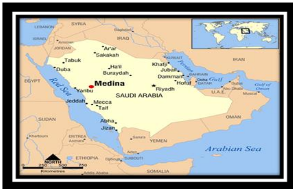
Figure 1 A map of the kingdom of Saudi Arabia and neighbouring countries

his tomb, which is a shrine, and there are also many historical Islamic places there such as many grand mosques, the tombs of the prophet Muhammad's wives and friends and the mountains where some of the prophet's battles took place. Consequently, due to Medina's historical and holy background, an estimated 3 million Muslims make a pilgrimage annually to Mecca, where the prophet Abraham and his son built the first grand mosque, and visit Medina city (Al-Anssari, 1993; Almanac, 2012). The map below (Figure 1) showing Saudi Arabia and Medina was taken from 3rbe.com.