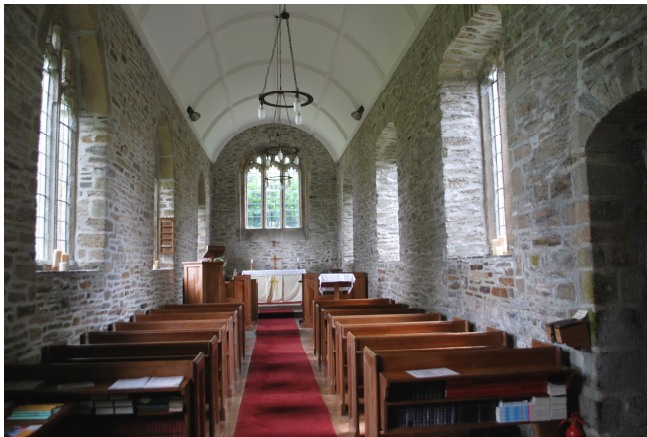
Fig.13.79: The interior of Sydenham Damerel Church 2015 (Source: author).