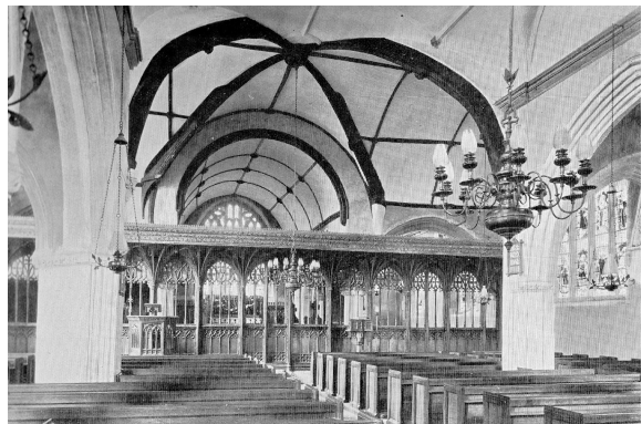
Fig.13.86: The interior of Honiton Church as it is today and how it was in 1911 before the fire (Stabb 1911, 59 and author).