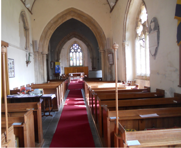
Fig.13.76: The interior of the Aveton Gifford Church in 2015 (Source: author).