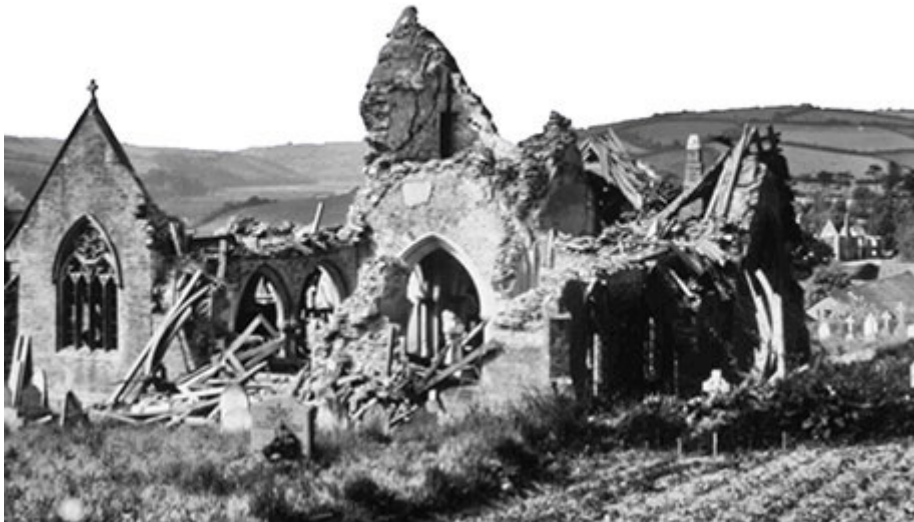
Fig.13.77: Aveton Gifford Church showing the bombed sanctuary (aveton-gifford-co.uk/facilities/church).