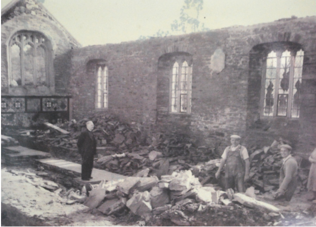
Fig.13.78: An undated photograph of Sydenham Damerel Church showing the fire damage and the decorated altar screen.

that Davidson had recorded were lost. The photograph shows the workmen, who reused all the stone window mullions, but the tiled altar screen seen in the photograph was not replaced (Figs.15.83-15.84).