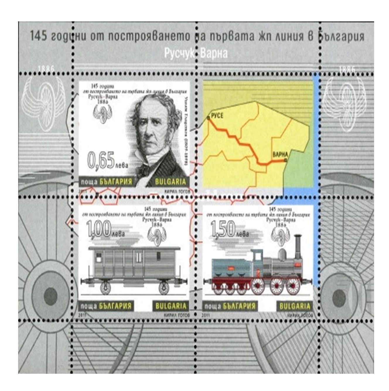
Figure 5: 27 October 2011 The 145th Anniversary of the First Railway Line in Bulgaria - Ruschuk-Varna