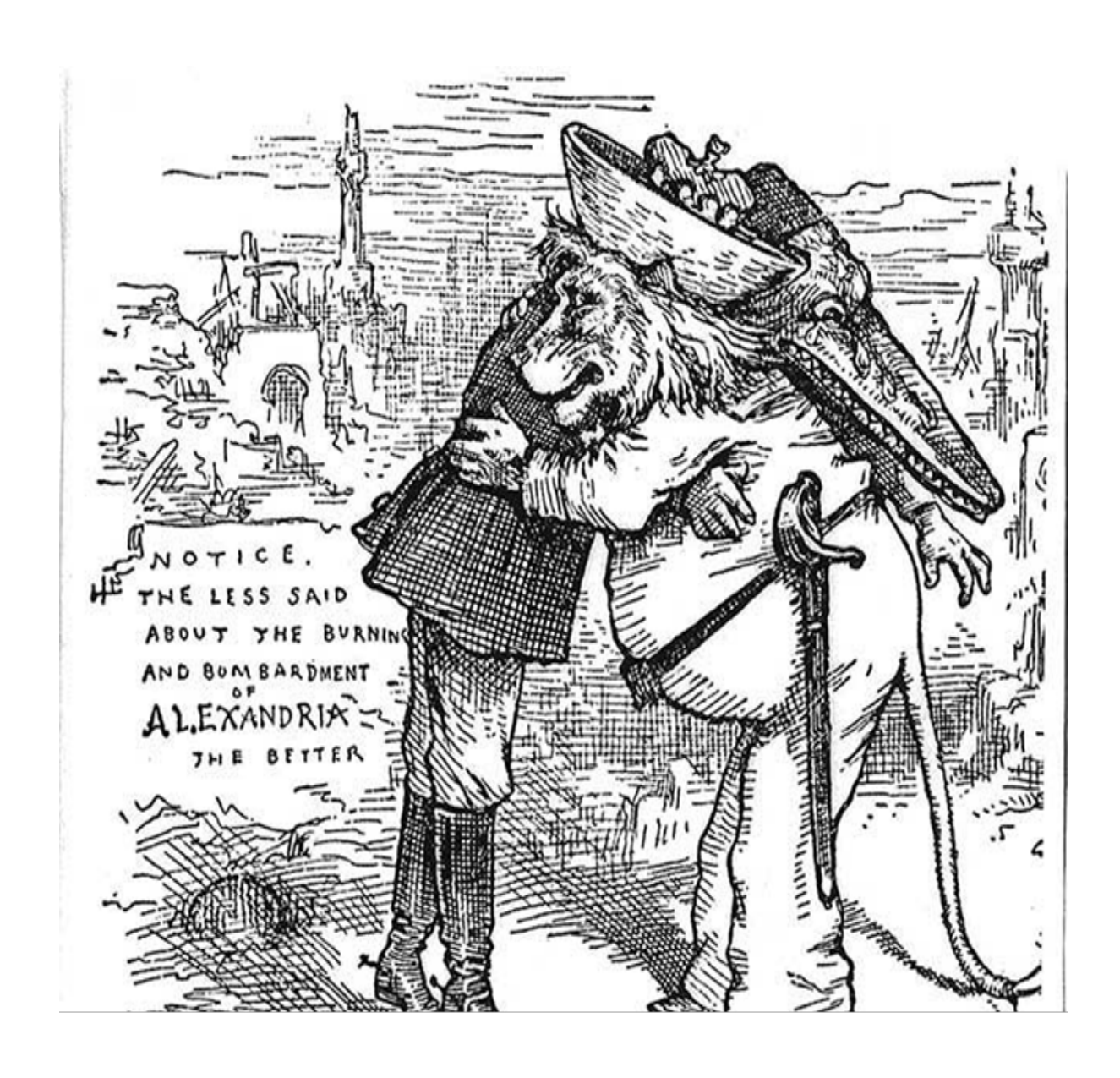
Figure 4: 22 July 1882, Harper's weekly