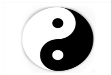
(Yin- Yang in Tai Chi)