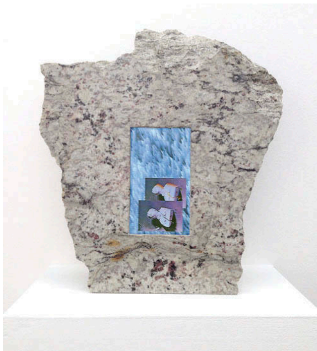
FIGURE 2 Common era: Kairos . Granite, 7" tablet monitor, moving image (23:00-minute loop), 30 × 40 × 3 cm © Verity Birt; used with permission. The moving image can be viewed at http://reconfiguringruins.blogs.sas.ac.uk/ruins-elsewhere-otherwise/ce-ii-excerpt/ . (Color figure available online.)

with deeper time, yet although its surface is polished, it is also partly a rough and raw piece, suggesting that it has been broken off or that is somewhat damaged.