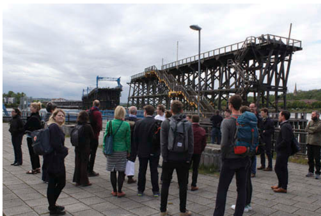
FIGURE 5 The Dunston Staiths, Newcastle-upon-Tyne, during our visit as part of the second workshop. (Color figure available online.)