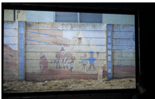
FIGURE 3 Modern ruins? A drawing depicts "fake" pyramids with a film crew. Scene from Brown and Robinson's The Ten Commandments (2015) taken during the exhibition at The NewBridge Project in Newcastle, October 2015. (Color figure available online.)

What The Ten Commandments showed us with eloquent simplicity is that one way of reconfiguring a ruin is by looking at the different practices that evolve around it over time and in relation to different contexts. Did we know that Japanese internees of war from the West Coast of the United States would enter the discussions related to our project? Most certainly not. Did it matter? Without a doubt. Entirely in the spirit of our project, the very excavation that Brown and Robinson set themselves to in the commission was based on openness and room for adjustment. Not only did their interpretation of ruins provide an element of surprise for us—we did not know what the artwork would look like until we saw the three-screen installation at the NBP launch in Newcastle—but it was also a reminder of the premise that the Eurocentric views on ruins and the very concept of Ruinenlust should be challenged and refined in practice. The