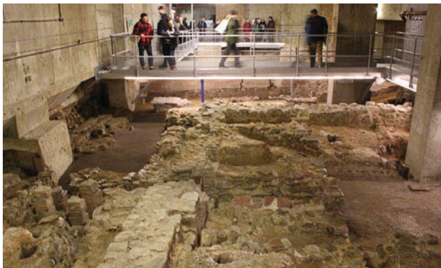
FIGURE 4 Visiting the Billingsgate Roman bathhouse in the City of London during the Reconfiguring Ruins London workshop in January 2015. (Color figure available online.)

The visit to the bathhouse in the City of London gave us a firsthand experience of the Roman past preserved within a building opposite the old Billingsgate Market in Lower Thames Street (Figure 4). The contrast could not be more telling: Concrete columns pierce through the remains of part of a Roman building, including a mosaic floor, built sometime in the third century AD. The columns support an office block built in the late 1960s, which in 2015 remained largely empty.