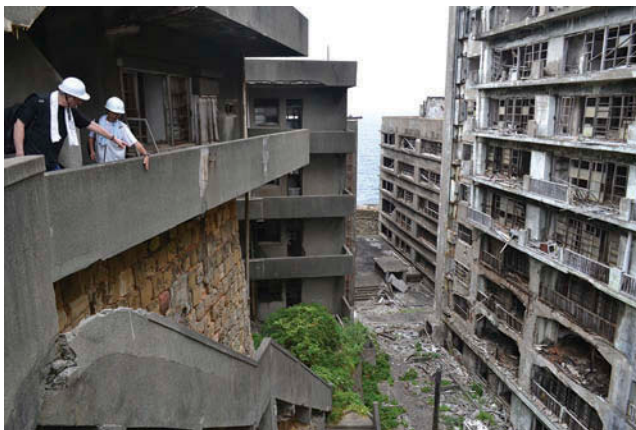
FIGURE 6 Hashima Island. (Color figure available online.)

Hashima was also developed in the late nineteenth century as an access point to an undersea coal seam. Over time, development of the island slowly transformed its profile, eventually burying the bedrock under concrete high-rise constructions built to house the expanding