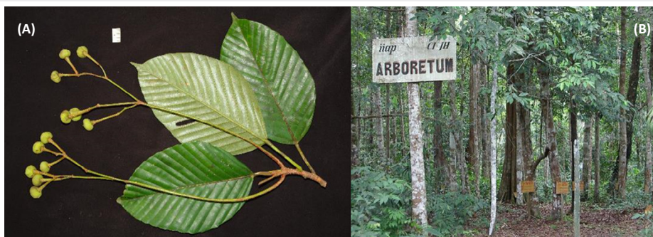
Trends in Ecology & Evolution

Most of the species that remain to be described are likely to be rare, but some might be both widespread and surprisingly common. For example, Drypetes gentryana was described in 2014 from a permanent plot in the Yanachaga Chemillén National Park on the eastern flank of the Andes in central Peru [11]. Previously collected sterile vouchers collected from other permanent plots have since demonstrated that this species is also found in aseasonal and seasonal forests spanning >1000 km in lowland Peruvian Amazonia. The plot data also demonstrate that this species occurs with local abundances of two or more stems per hectare, which would classify the species as an ‘oligarchic’ taxon: both locally common (abundance of one or more stems per hectare) and widespread [59]. This example demonstrates the benefit to taxonomists of working with distributed permanent plots: the plot data provide information on the distribution and local abundance of new taxa, which contributes to assessments of their ecology and conservation status.