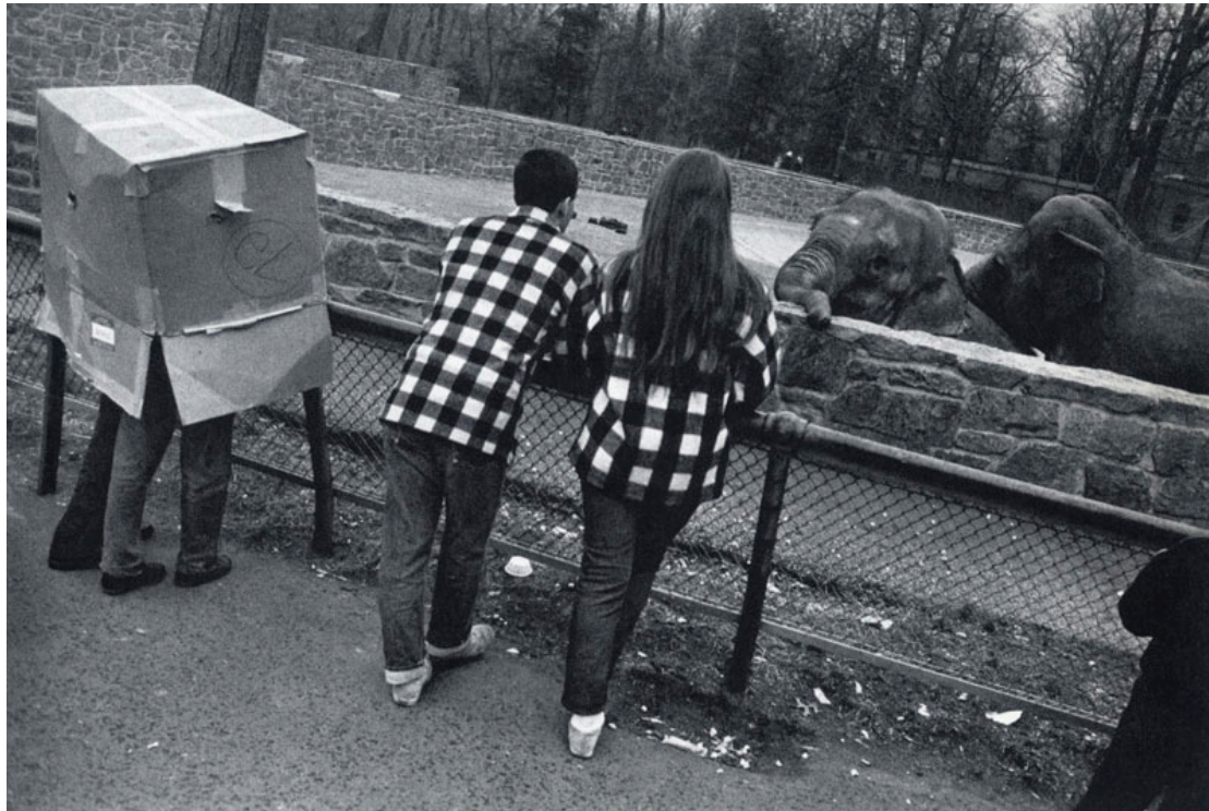
'New York, 1962'. Plate 27 of 'The Animals' @ the Estate of Garry Winogrand

The zoo, seen through Winogrand's pictures, is very much a place of encounter yet one where genuine human/animal interaction is limited to a series of relatively mundane acts. Human/animal relationality is implied and suggested in these images, first, through the reassurance and entertainment value (Hanson 2002) of a shared – and ironic - common animality ('they' are sometimes like 'us'/ 'we' are sometimes like 'them' – the animal as the 'originary metaphor', Lippit 1998), second, through the active performance of what Anderson (1995, 276) calls the 'cultural self-definition' of distance from (and dominance of) the natural world and, third, through symbolic subjugation: