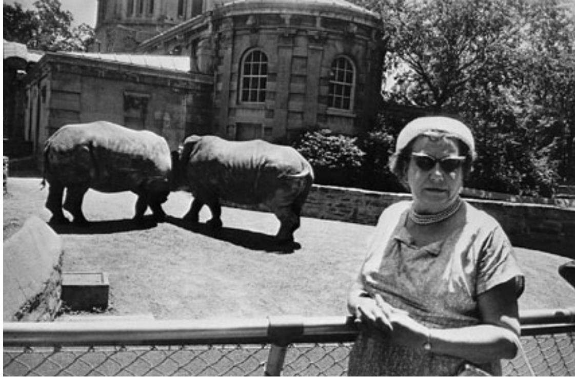
'New York, 1963'. Plate 9 of 'The Animals'

"I grew up within walking distance of the Bronx Zoo. And then when my first two children were young, I used to take them to the zoo. Zoos are always interesting. And I make pictures. Actually, the animal pictures came about in a funny way. I made a few shots. If you could see those contact sheets, they're mostly of the kids and maybe a few shots where I'm just playing. And at some point I realized something was going on in some of those pictures, so then I worked at it [ ... ] I kept going to the zoo because things were going on in certain pictures. It wasn't a project" (Winogrand, quoted in Diamonstein 1982, unpaginated).