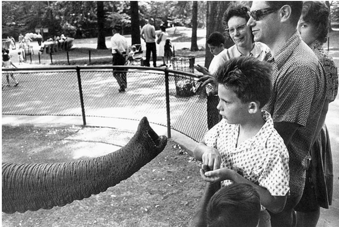
Bronx Zoo, 1963. Plate 18 of 'The Animals'