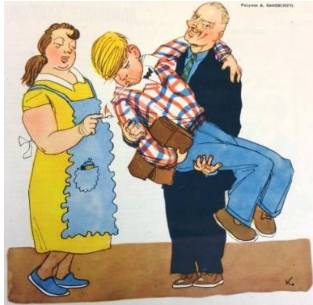
Figure CM.3: A. Kanevskii, 'Busy Hands', Krokodil , no. 35, 1958

Whilst the rhetoric of parental blame did not disappear completely, in the early 1960s there was a shift in the portrayal of these problematic youth as parents now came to be represented as victims of their children's idleness rather than the root cause of it. However, their frivolous lifestyle remained central to these cartoons as they were depicted sleeping off the excesses of 'dancing, restaurants and picnics', being buffed and preened by their parents or lounging on the sofa being waited on by family members, although this time more out of coercion than pandering. 33 In many images, interest in fashion and personal grooming was used to signify the lack of ideological zeal in these youths. For example, in one Krokodil cartoon from 1962, a fashionably-dressed hula-hooping girl defends her lifestyle to her parents, shown pegging out the laundry, by proclaiming 'I don't work? All day long I spin like a squirrel in a wheel!' 34 In another from October 1965, the immaculate and Westernised dress of a brother