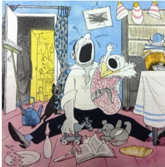
Figure CM.1: V. Chizhikov, 'Ma-a-ama!', Krokodil , no. 5, 1964.

As Lynne Attwood has highlighted in her analysis of early Soviet women's magazines, 'newspapers and magazines were credited by the leaders with enormous importance in socialising the population. They were seen as the main channel of communication between the Communist Party and the people, and a crucial means of disseminating propaganda'. 3 But the importance of these publications in educating and moulding Soviet people was not simply confined to the stories they told or the articles they published; the images they featured also had a crucial role in both creating the New Soviet Person and in articulating the concerns and values of contemporary society and this was equally the case for cartoons and caricatures as it was for fine art. The importance of the satirical image for Soviet socialisation was made clear by the renowned cartoonist Boris Efimov in an article written for Voprosy literatury in early 1962: