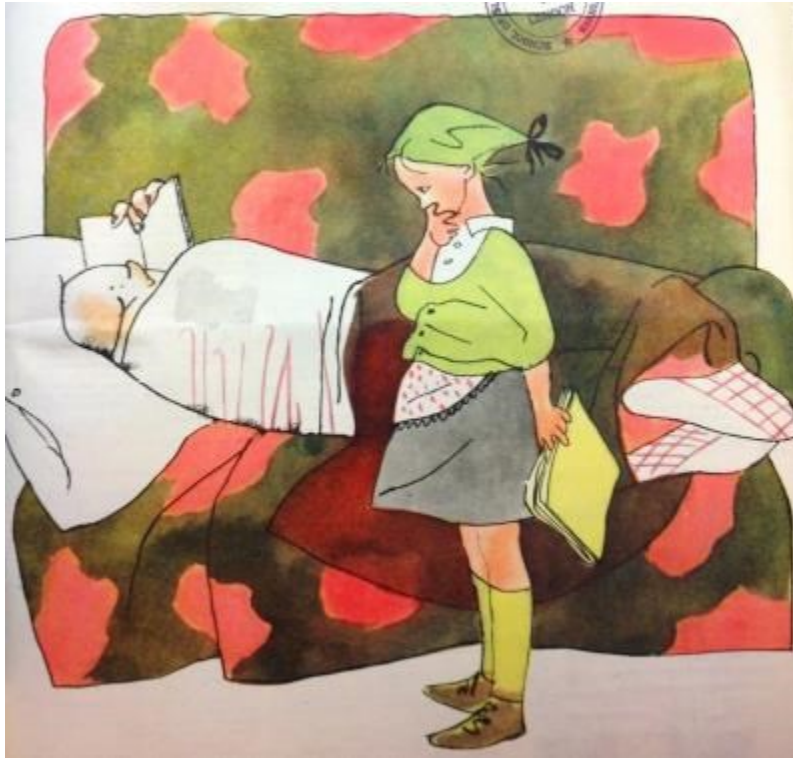
Figure 4: V. Goryaev, 'Papa, What is Nobility?' Krokodil , no. 24, 1962.

Through these images, then, it is possible to 'reverse engineer' what the ideal father was perceived to be during the Khrushchev era. The derision aimed at those men who showed no interest in their child's education, who were too busy to play a role in their child's life or who set a poor moral example for their offspring demonstrate that even during the 1950s paternal responsibility was portrayed as being far more multifaceted than simple financial support and the imposition of discipline. It demanded an emotional engagement and day-to-day involvement more commonly associated with later attitudes towards the father's place in the family. While there may have been ambiguity surrounding what role the Soviet man had in the maintenance of the family home, there was no doubt that he had a crucial part to play in successfully raising the next generation, and such representations of 'bad' fathers served to reinforce this ideal.