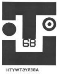
Figure 1. Aberystwyth Arts Festival 1968 programme cover.