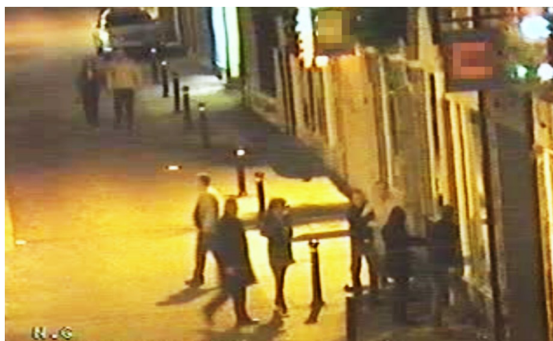
Figure 1c. The two bystanders are joined by others. A male bystander in a dark shirt and jeans pulls the main aggressor from his target, while a female bystander steps between the conflict parties and extends both arms out in a blocking motion.