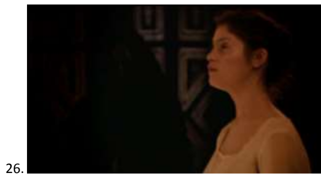
Figures 23-26: the aesthetic of invisibility. Figure 23: extreme contrast; figure 24: the Duchess and Bosola both within the frame, with Bosola invisible; figures 24-25: rack focus privileging the