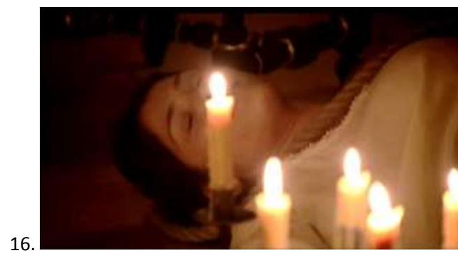
Figures 9-16: selection of shots of the death of the Duchess; 9: final appeal to the audience in the upper gallery; figure 15: wide shot; figure 16: “dazzling” face that concludes the sequence as Ferdinand enters to look at his sister’s body.