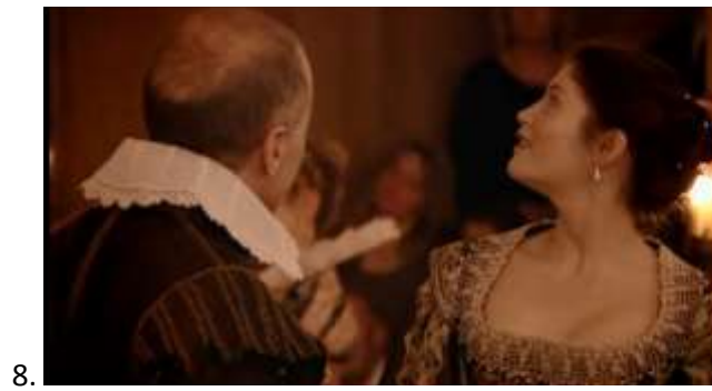
Figures 4-8: exposition scene with alternating viewpoints onto the multi-faceted Duchess