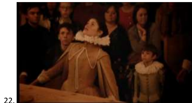
Figures 21-22: the “Bosola camera” capturing the Duchess’s sinister rejection by the central forces of Duke Malatesta’s order in the dumb show at the shrine of Ancona