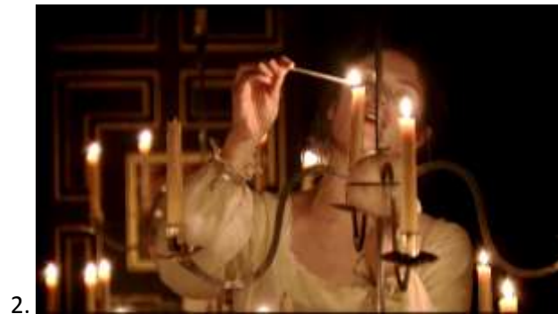
Figures 1 and 2: transitional candles: televisual dissolve of candelabrum over the extreme wide-angle shot of the stage from the static upper gallery camera (figure 1); Duchess lighting candles while singing (figure 2)

Even so, Ian Russell was ready to admit that capturing the particular sensory environment of the Sam Wanamaker Playhouse made it “trickier than usual” to produce a satisfactory theatre broadcast that would be true to the promise made by Tony Hall (Director General of the BBC) that the BBC’s audiences would be given the televisual equivalent of “front row seats” (Hall cited in Shervin). 8 The layout of the compact auditorium, with gallery pillars obstructing sightlines, meant that all six cameras in the Sam Wanamaker Playhouse had to be static on their tripods. As a consequence, the camerawork overwhelmingly reinforced the sense of poise and stateliness of the court of Amalfi. It is because of the static nature of much of the broadcast that the disruption of order which comes with Ferdinand’s lycanthropy, with his frenzied dashes across the stage, was the more obviously heightened by the sudden pans and tilts that followed his erratic movements and those of the