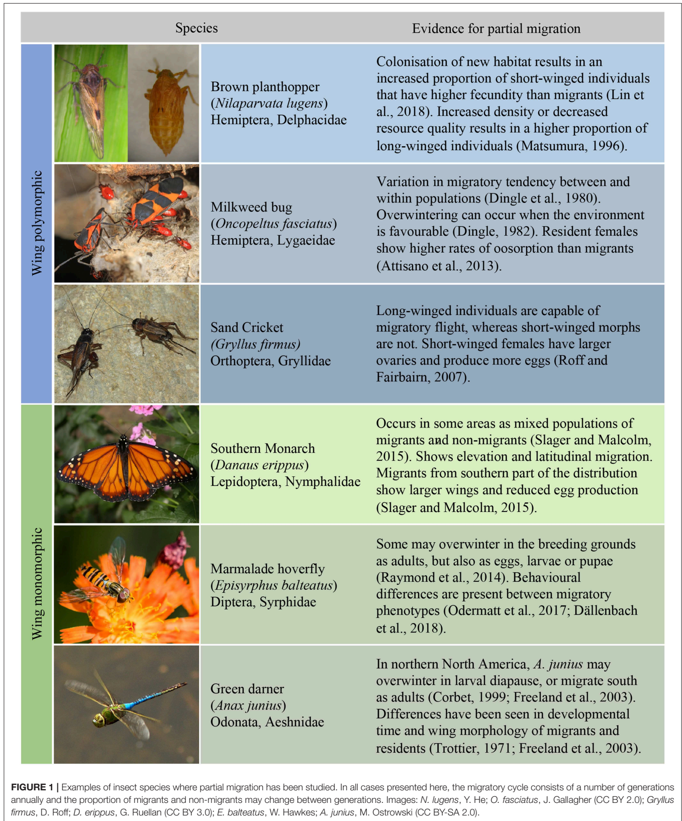
FIGURE 1 | Examples of insect species where partial migration has been studied. In all cases presented here, the migratory cycle consists of a number of generations annually and the proportion of migrants and non-migrants may change between generations. Images: N. lugens , Y. He; O. fasciatus , J. Gallagher (CC BY 2.0); Gryllus firmus , D. Roff; D. erippus , G. Ruellan (CC BY 3.0); E. balteatus , W. Hawkes; A. junius , M. Ostrowski (CC BY-SA 2.0).