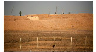
Moroccan soldiers stand on an earth wall separating areas of control in Western Sahara, September 2016

On October 30, the UN Security Council (UNSC) adopted a resolution extending the mandate of the UN Mission for the Referendum in Western Sahara (MINURSO) for another twelve months. After three six-month extensions, this signifies a return to 'business as usual' in the UN approach to the frozen conflict, following a period of unusually intensive efforts to revive negotiations, primarily due to former US National Security Advisor John Bolton's involvement.